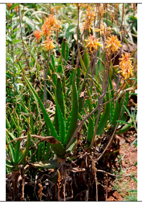
14-18 ascending leaves are 50-60cm long X 7-8cm wide; red tipped 3-4mm teeth are in "waves", slightly forward pointing, 25-30mm apart; sap dries orange-ish; inflorescence 75-90cm tall, 3 to 8 branches, some rebranched, upward curving; fairly densely capitate flowers. Older plants bear longer stems.

The first could be Sinana or Adigratana; the second Neosteudnerii. They could be none of these, but are unlikely to be hybrids. Can anyone pin down the identity of these aloes?