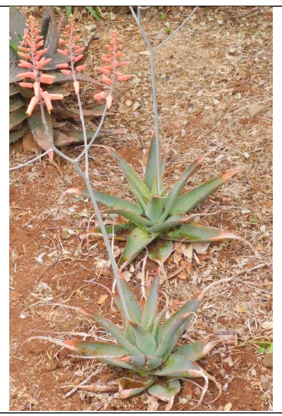
30-32 leaves in spread rosette are c35cm long x 8-10cm wide, when dry take on reddish tint; red/brown, upright (pungent) teeth are tiny (1.5mm); sap dries clear over green pulp; teeth 12-20mm apart; infloresence to 90cm, 3-5 branched, upward curved; laxly-flowered. Stemless (so far).

Nature Kenya, P.O. Box 44486, Nairobi 00100, Kenya Tel: 0750149200/0751624312/0771343138 E-mail: office@naturekenya.org