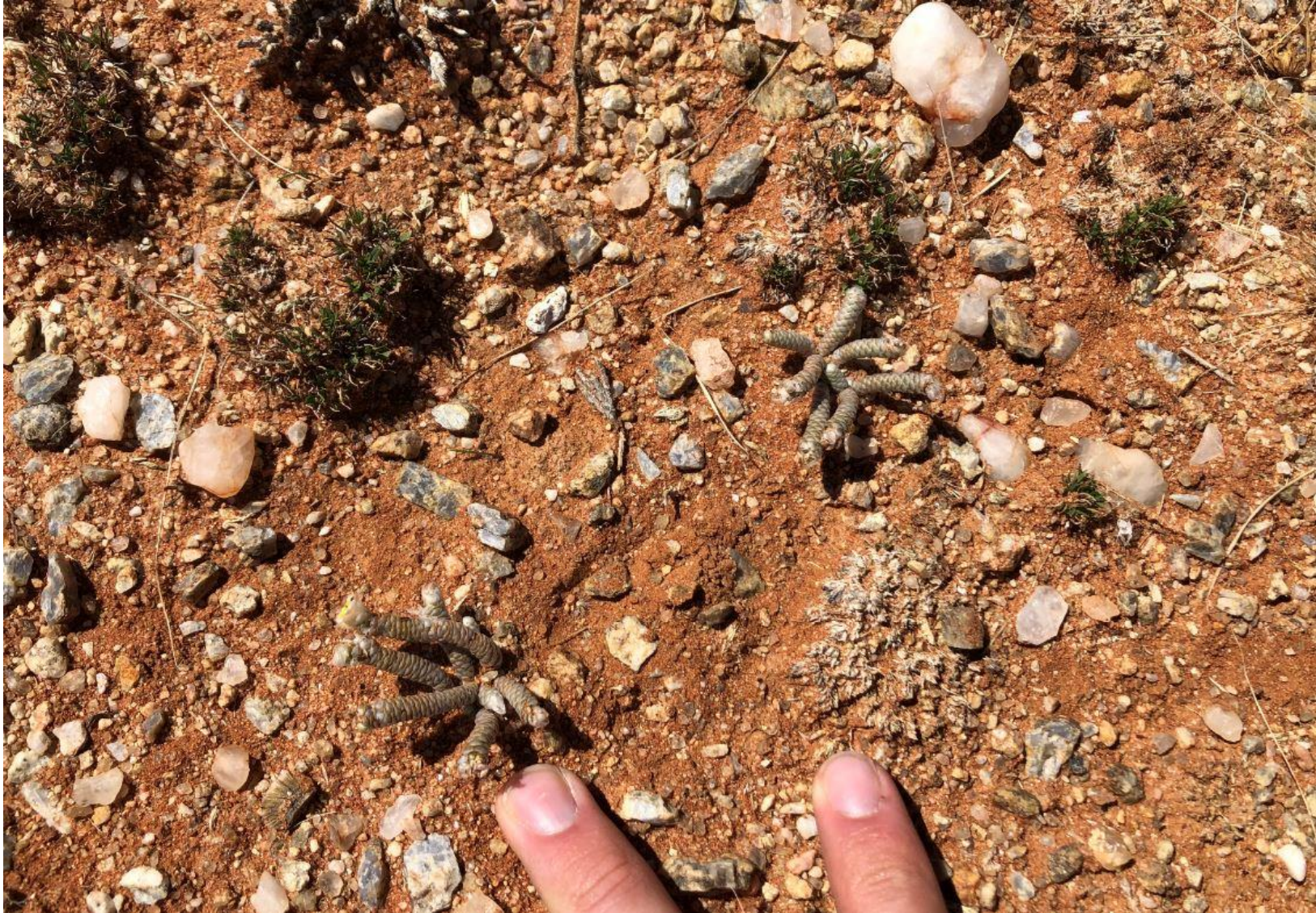
Figure 4. Image indicating presence of A. albissima within the PV 3 site.