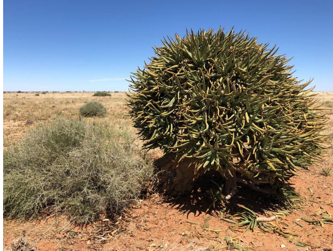
Figure 3. Image of Dinteranthus pole-evansii (Left). Image of Aloidendron dichotomum (right).