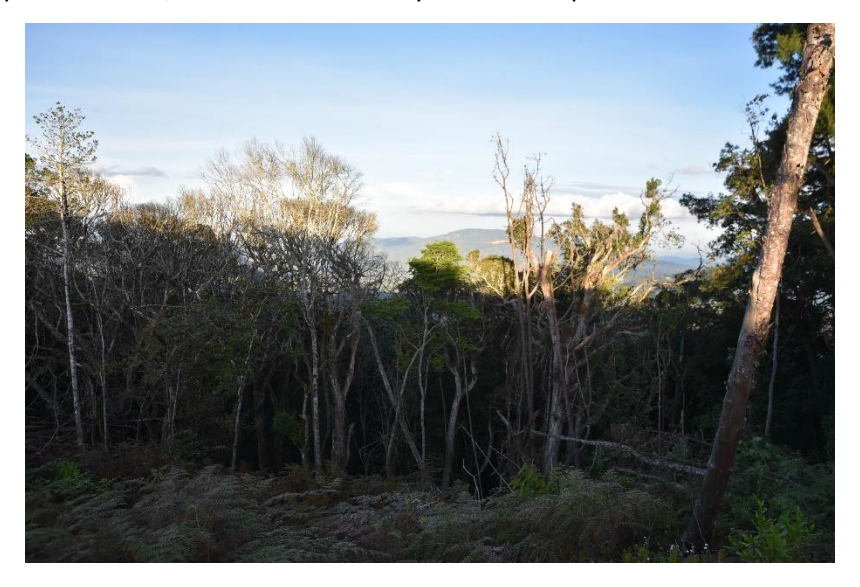
Taita Hills site affected by fire, showing invasive species invading after fire

There is a lack of awareness among community members on controlled burning, or alternative agricultural practices such as permaculture, that could increase yields and improve soil.