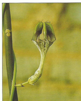
Fig. 2. Ceropegia nilotica

On the heavy clay soils along the Pongola River, this species is also commonly found. The plant prefers to clamber up Acacia shrubs where the