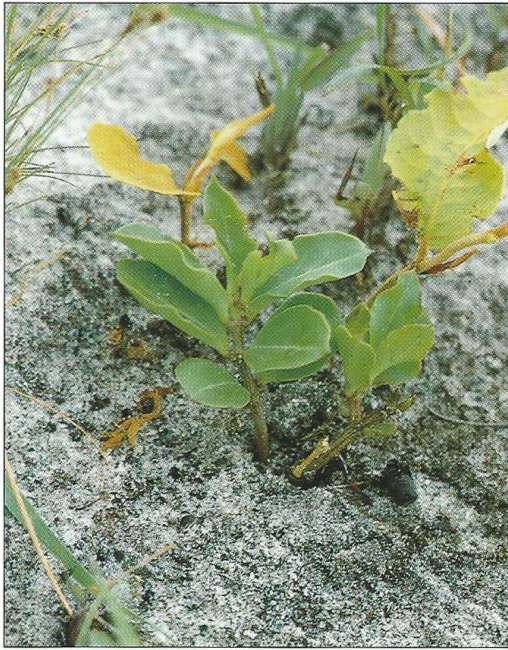
Fig. 5. Ceropegia conrathii