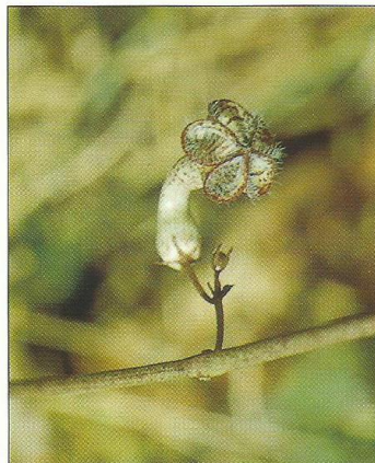
Fig. 1. Ceropegia carnosa

This species which grows from a perennial fusiform rootstock grows in