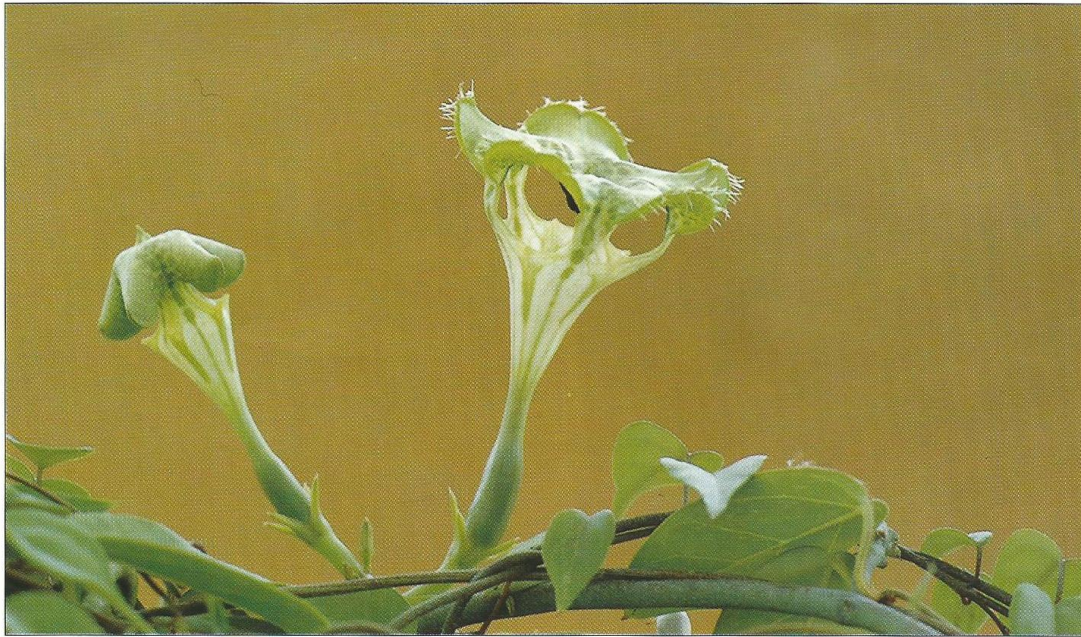
Fig. 3. Ceropegia sandersonii