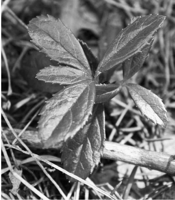
FIGURE 19. Chimaphila umbellata . Leaves depicted. July 12, 2009.

Gaylussacia baccata (Wangenh.) K. Koch; Huckleberry; locally common in mixed forested dunes and along margins of wetlands; D061; C 7