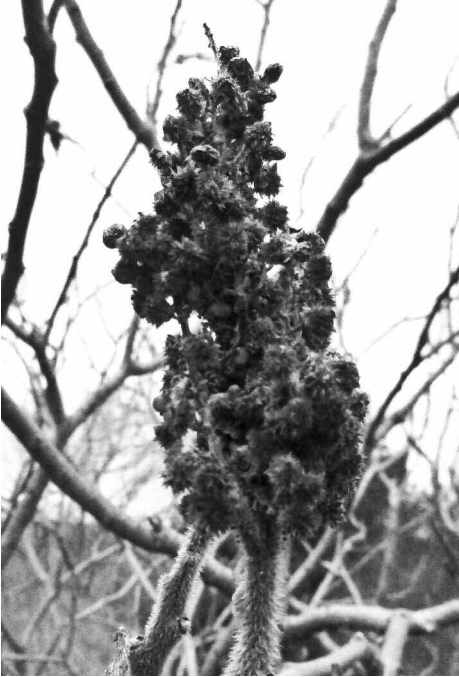
FIGURE 16. Rhus typhina . April 21, 2017.

Corispermum pallasii Steven; Bugseed; occasional on open dunes; D393; C 3