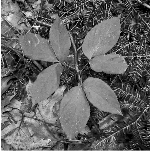
FIGURE 17. Aralia nudicaulis. Leaves depicted. August 24, 2014.