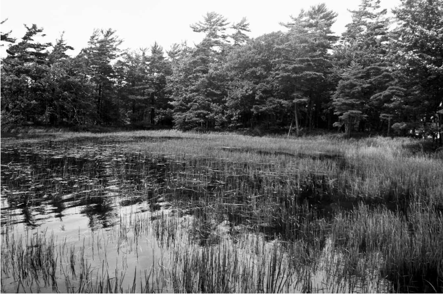
FIGURE 10. Emergent Marsh. July 17, 2016.