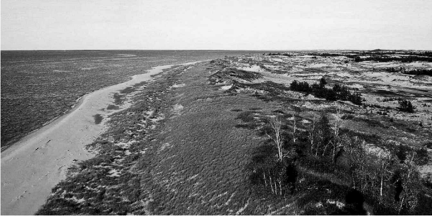
FIGURE 13. Open Dunes—view north from Big Sable Point Lighthouse. October 22, 2008.

mophila breviligulata , Calamovilfa longifolia , Schizachyrium scoparium , Arabisopsis lyrata , Artemisia campestris , Cirsium pitcheri , Euphorbia polygonifolia , Lithospermum caroliniense , Monarda punctata , Solidago simplex , Hudsonia tomentosa , Prunus pumila , and Salix cordata .