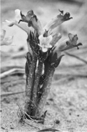
FIGURE 3. Orobanche fasciculata. No date.