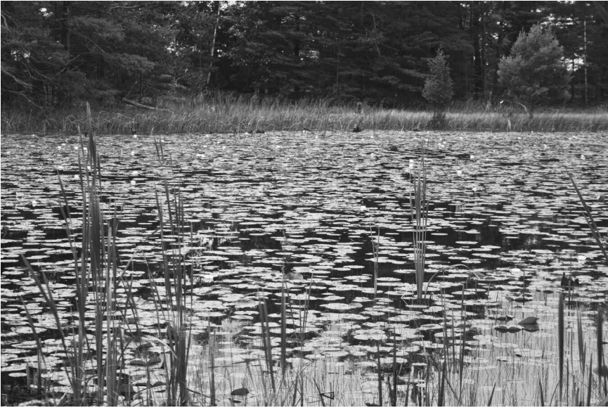
FIGURE 9. Submergent Marsh. July 15, 2016.

narrow- and broad-leaved graminoids (i.e., grass-like plants) and herbs that extend above the water surface (i.e., emergent plants), as well as floating-leaved plants. (Cohen et al. 2015).