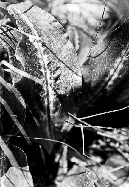
FIGURE 7. Goodyera oblongifolia . Leaves depicted. May 31, 2009.