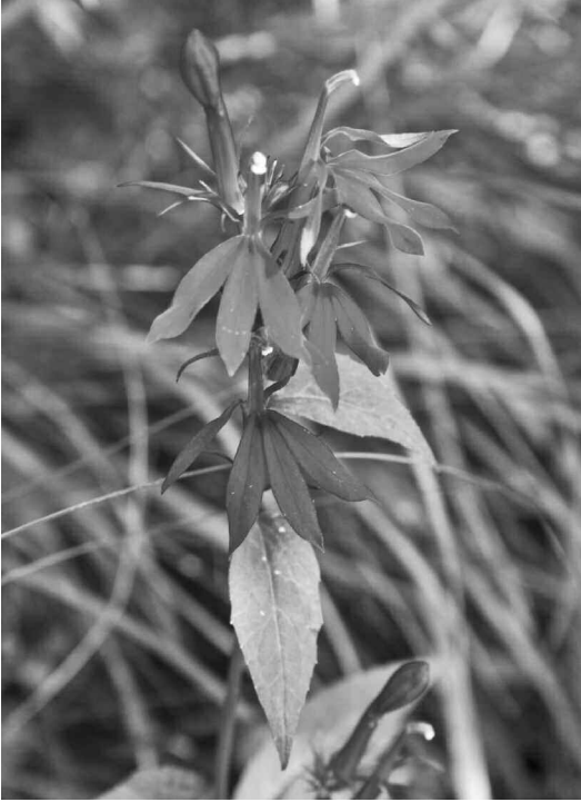
FIGURE 18. Lobelia cardinalis . September 3, 2007.

Rorippa palustris (L.) Besser; Yellow Cress; rare along margins of interdunal emergent wetlands; D337; C 1