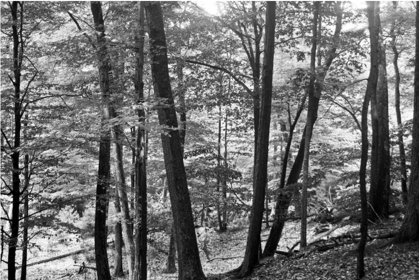
FIGURE 12. Dry-Mesic Northern Forest. July 17, 2016.

This plant community is interspersed with Great Lakes Barrens and dominates the northern third and the southern third of the Park (Figures 1 and 13). Characteristic species found in this community within the Park include: Am-