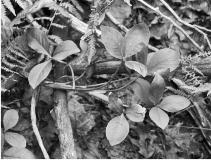
FIGURE 20. Menyanthes trifoliata . Leaves depicted. September 3, 2007.

Nymphaea odorata Aiton; Sweet-Scented Water-Lily; locally common in deepwater aquatic bed wetlands; D098; C 6