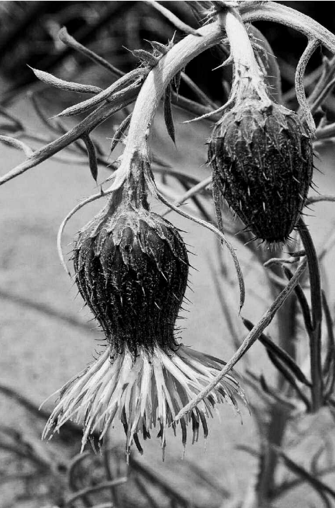
FIGURE 2. Cirsium pitcheri . June 21, 2009.

The Michigan Natural Features Inventory (MNFI) tracks plants that are protected at the state level under the categories Endangered (E), Threatened (T), and Probably Extirpated (referred to as “listed” species). In addition, the MNFI notes species of Special Concern (SC), which, although not legally protected, are of concern because of their small or declining population sizes. Four species known from the Park are listed or treated as Special Concern by the State of Michigan. These are Cirsium pitcheri (Figure 2) (T), Orobanche fasciculata (Figure 3) (T), Cypripedium arietinum (Figure 4) (SC), and Corispermum pallasii (Figure 5) (SC). Although Cirsium pitcheri , (which also has a federal Threatened status), remains common within open dune habitat in the Park, neither Orobanche fasciculata nor Cypripedium arietinum were located during repeated surveys from