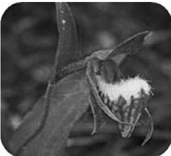
FIGURE 4. Cypripedium arietinum. Summer 2007.