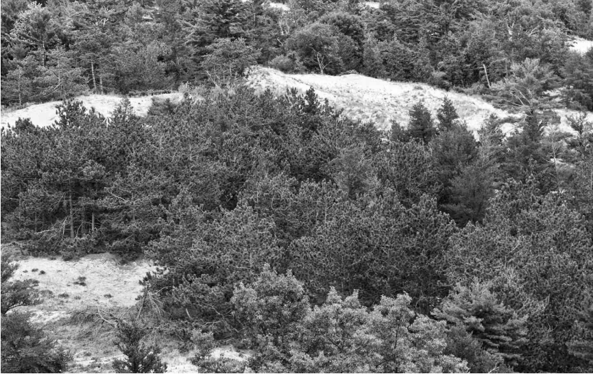
FIGURE 14. Great Lakes Barrens. July 15, 2016.

being quite shallow, spring ephemeral wildflowers are relatively few. Among the most widespread spring ephemerals are Maianthemum canadense , Maianthemum racemosum , Maianthemum stellatum , Polygonatum pubescens , and Trientalis borealis . Interestingly, a small population of Hepatica americana was found in black loamy sand along the southeastern edge of the Park, which is the only location in the park with this mapped organic soil (USDA, NRCS, FS 1995).