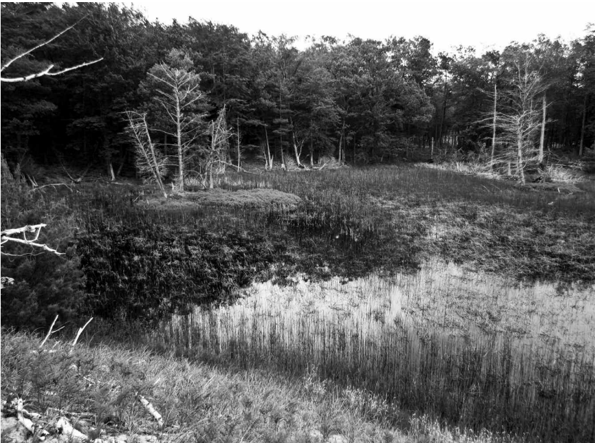
FIGURE 11. Interdunal Wetland. June 8, 2013.