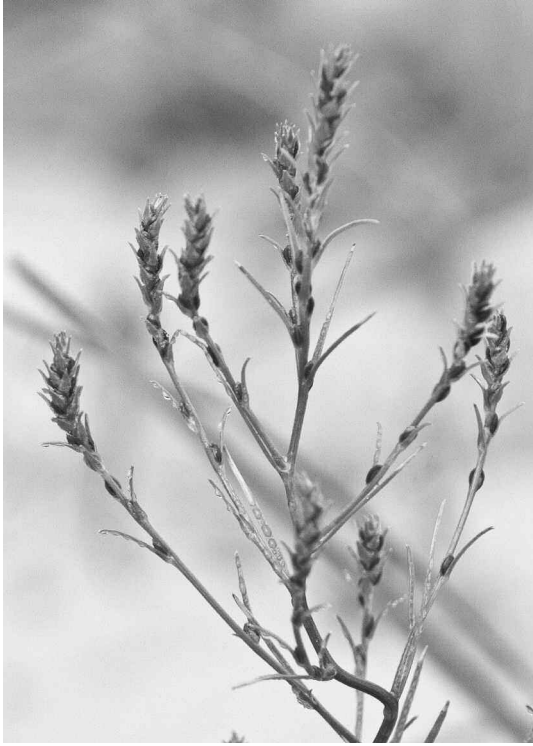
FIGURE 5. Corispermum pallasii . Fruit depicted. September 11, 2011.