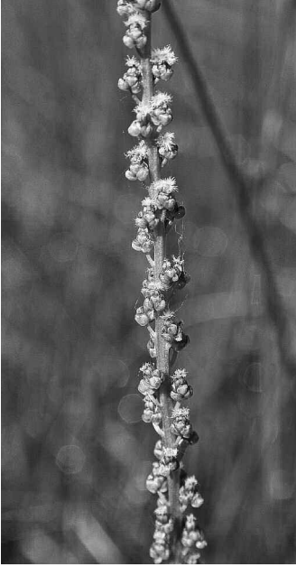
FIGURE 8. Triglochin maritima . July 5, 2009.

largest examples of these three communities in the Great Lakes region (MDNR, P&RD, 2016). Descriptions of these natural communities follows.