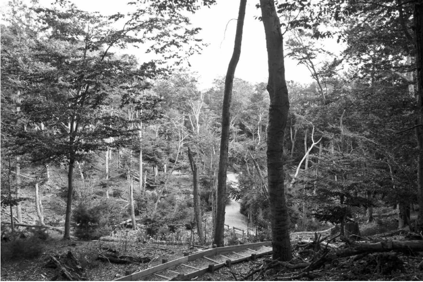
FIGURE 15. Ravine with extensive beech bark disease mortality. September 3, 2007.