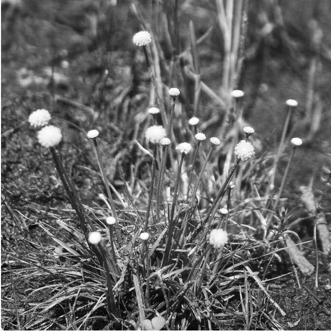
FIGURE 6. Eriocaulon aquaticum . July 15, 2012.