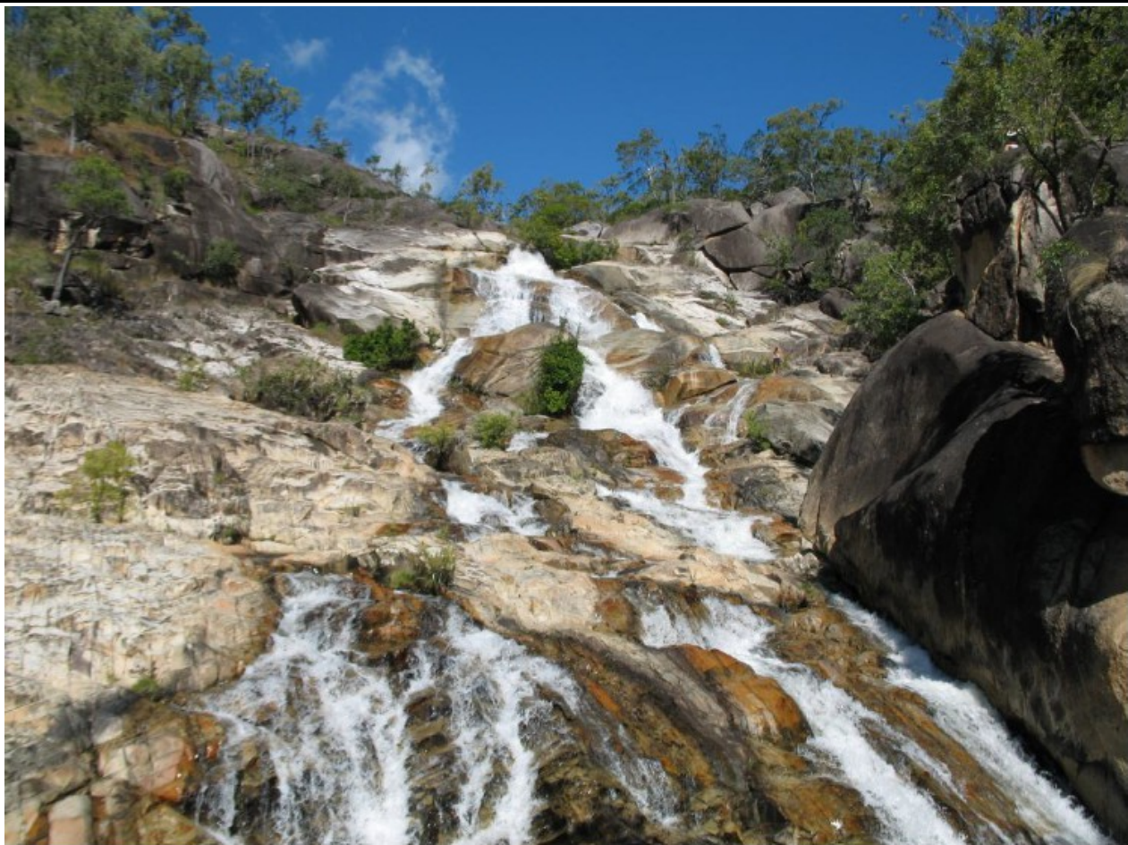
Emerald Creek Falls, 21 April 2007 (R.L. Jago)

The substrate and outcrops adjacent to the falls are composed of Tinaroo Granite (280-270 million years of age) with the face of the falls composed of a fine grained aplite dyke, which was probably injected around the later stages of the solidification of the Tinaroo Granite.