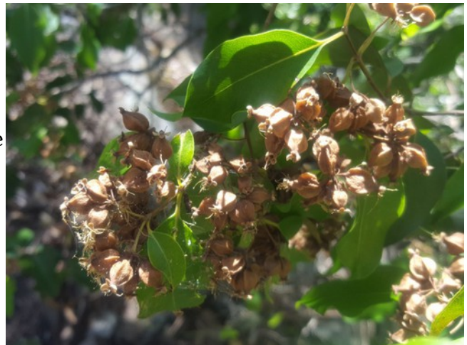
Backhousia tetraptera growing on Leichhardt Creek, north of Townsville.