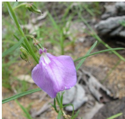
Afrohybanthus enneaspermus Afrohybanthus stellarioides

SANTALACEAE Exocarpos latifolius Santalum lanceolatum SAPINDACEAE Dodonaea lanceolata var. subsessilifolia Hop Bush Guioa acutifolia Glossy Tamarind Jagera pseudorhus var. pseudorhus Foambark SAPOTACEAE Sersalisia sericea SPARRMANNIACEAE Grewia retusifolia SYMPLOCACEAE Symplocos puberula White Hazelwood THYMELAEACEAE Pimelea confertiflora Wikstroemia indica Tie Bush URTICACEAE Pipturus argenteus Native Mulberry VERBENACEAE * Lantana camara Lantana VIOLACEAE Afrohybanthus enneaspermus Spade Flower