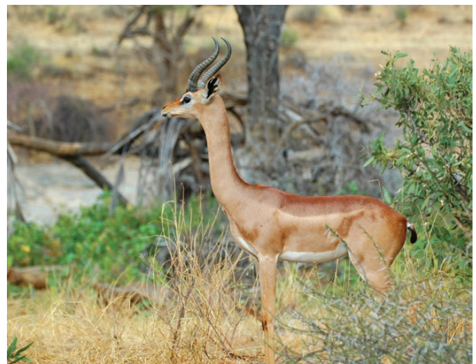
Fig. 1. —Adult male Litocranius walleri in Buffalo Springs National Reserve, Kenya.

Litocranius (Gazella) walleri : Kohl, 1886:79. First use of current name combination.