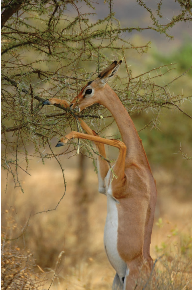
Fig. 4. —Adult female Litocranius walleri showing the typical behavior of feeding bipedally. Buffalo Springs National Reserve, Kenya.