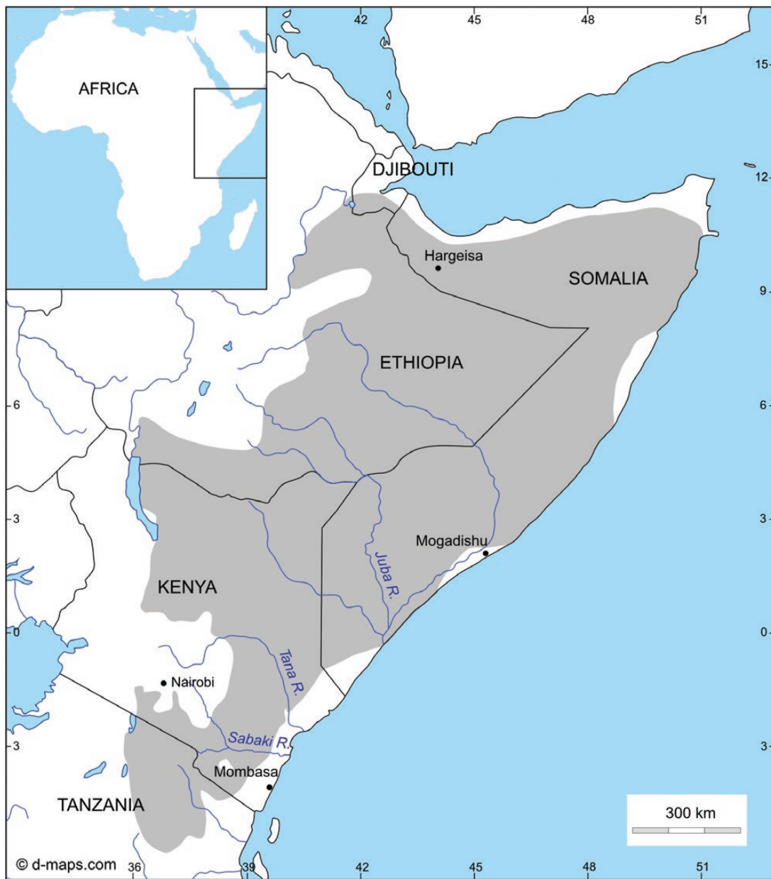
Fig. 3. —Geographic range of Litocranius walleri (based on IUCN 2016 ). Map is based on a customizable map of the Horn of Africa available on d-maps.com ( https://d-maps.com/carte.php?num_car=25596&lang=de ). The Sabaki River was added using the map “Tsavo national park map en.png” by Lencer, available on commons.wikimedia.org . Coordinates were added using the map of Kenya available on www.ducksters.com .

Antelope Specialist Group 2016 ) at elevations below 1,200 m ( Fig. 3 ). It presumably still occurs throughout its historical distribution, although recent information is not available from all countries inhabited by L. walleri . It is debated whether a gap in the species' distribution exists. Schomber (1963) stated that a gap exists in the distribution of the species between the Tana and Sabaki rivers in eastern Kenya, and that this gap separates the two subspecies of L. walleri , L. w. sclateri north of the Tana, and the smaller L. w. walleri south of the Sabaki River. Leuthold (1971) clarified that the area of the potential species distribution gap is simply understudied due to its difficult accessibility. He cited personal communications