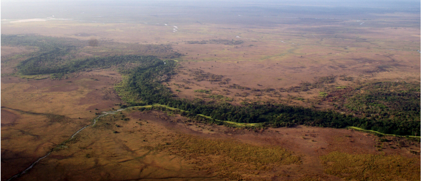
Figure 4. Thin riverine forest along minor branch of the Tana River, the habitat in the delta that is used by the Tana mangabey.

4). This riverine strip is situated along a minor branch of the Tana River which had some flow in April 2009 but held only stagnant water in January 2011, which could be rather worrying as loss of flow may negatively affect groundwater levels and therefore the survival of the forest. Unfortunately, there are no recent river level data from the Lower Tana that would allow us to compare water levels in April 2009 and January 2011 to evaluate if the drying-out in 2011 is simply related to a lower flow in the main river or an indication of a shift of the main flow out of the forested channel and into grassy floodplain channels. A new stageboard was installed by IRD (French Institute of Research for Development) and WRMA (Water Resources Management Authority) at Idsowe bridge in October 2011 (RGS 4G02) and should allow a better understanding of the river dynamics in the area in the near future.