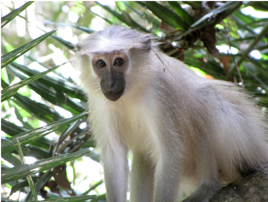
Tana River mangabey Cercocebus galeritus.