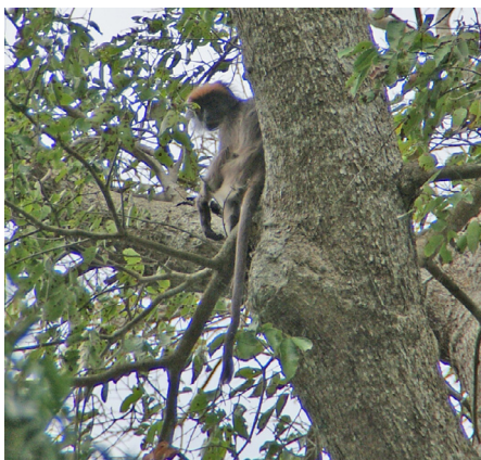
Figure 1. Tana River red colobus Procolobus rufomitratu rufomitratu .

The Tana River red colobus Procolobus rufomitratu rufomitratu (Peters, 1879) (Figure 1) and the Tana River mangabey Cercocebus galeritu (Peters, 1879) (Figure 2) are two threatened primate taxa endemic to a few dozen patches of riverine forest spread across some 60 km 2 of the Lower Tana River in Kenya (de Jong & Butynski, 2009), roughly between the northern border of the recently (January 2007) degazetted Tana River Primate National Reserve (TRPNR) and the Garsen to Witu road (Figure 3). The Tana River mangabey also has been recorded in one forest patch north of the TRPNR (Nkanjonja 1°45'05" S, 40°07'14" E), and a few records exist for both taxa from forest patches situated less than 5 km south of this road (Karere et al. , 2004), all of them situated on the eastern bank of the Matomba branch of the Tana River. Population estimates for both species vary between authors, but are between 800 and 1200 for P. r. rufomitratu and between 1200 and 2000 for C. galeritu (Butynski & Mwangi, 1995; Karere et al. , 2004). Their preferred habitat, the riverine forest of the Tana River, is in rapid decline through a combination of factors (Hamerlynck et al. , 2010), including reduced flooding (Maingi & Marsh, 2002), loss of forest cover (Moinde-Fockler et al. , 2007) and habitat quality degradation (Luke et al. , 2005).