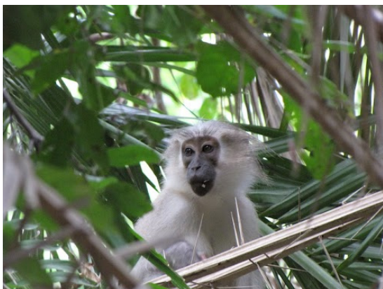
Figure 2. Tana River mangabey Cercocebus galeritu galeritu .

The taxonomy of red colobus is complex because few taxa are sympatric and because it is mostly based on coat-colour variation, a criterion that has considerable intra-taxon variation (Struhsaker, 2010). As a species, Procolobus rufomitratu is now considered of Least Concern, mainly because of its widespread occurrence in the Congo Basin. The quite characteristic, restricted-range Tana subspecies P. r. rufomitratu , however, is listed as Endangered, and is considered a full species by some experts (e.g., Mbora & Butynski, 2009).