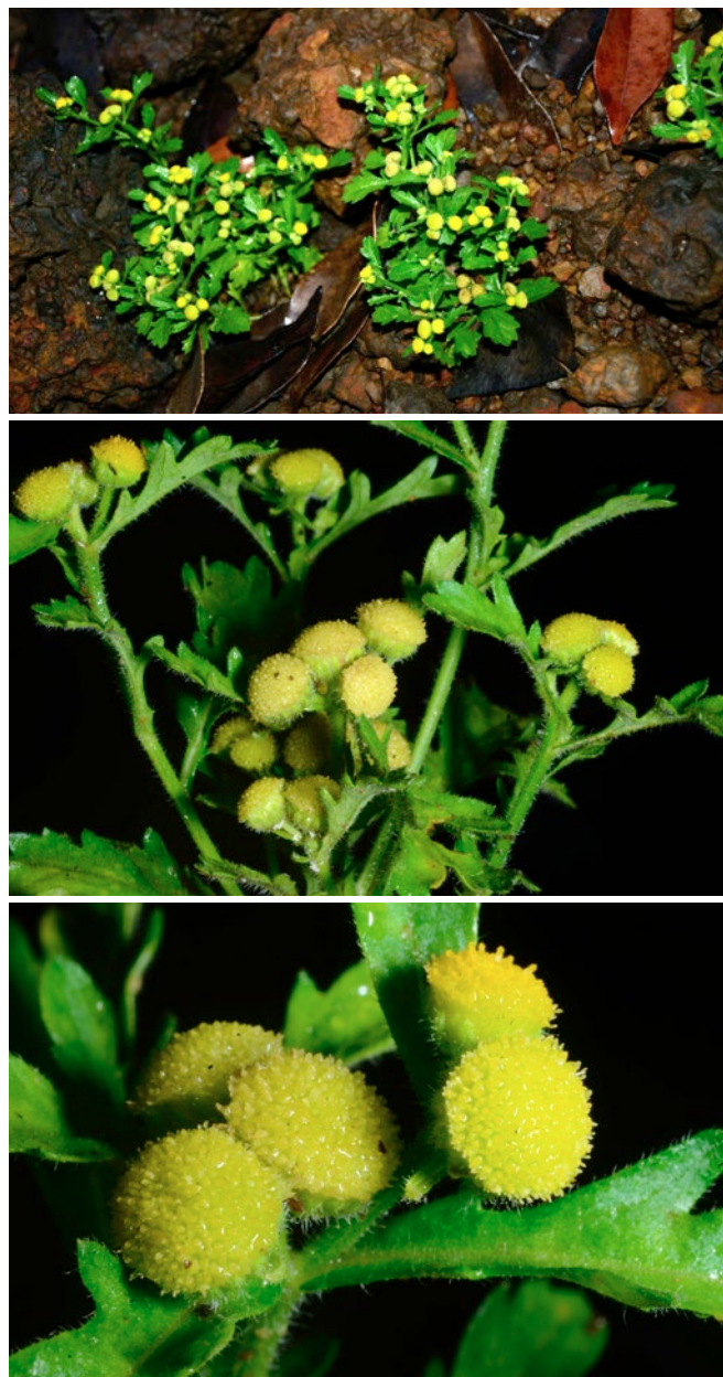
Fig. 1. – Grangea ogoouensis O. Lachenaud & Beentje. A. Entire plant in habitat; B. Capitula and upper leaves; C. Capitula. [Bidault et al. 1822]

0.15–0.3 mm long; inner florets many, bisexual, funnel-shaped, corolla 0.8–1.3 mm long, of which the lobes 0.2–0.3 mm, with a few hairs (and sometimes a few glands). Achenes 3-angular or (?when young) flattened, 0.8–1.2 mm long, slightly pilose, with a few glands; the outer with caducous pappus of 6–16 bristles 0.2–0.3 mm long; the inner with pappus of 12–18 slightly broad-based bristles 0.3–0.6 mm long.