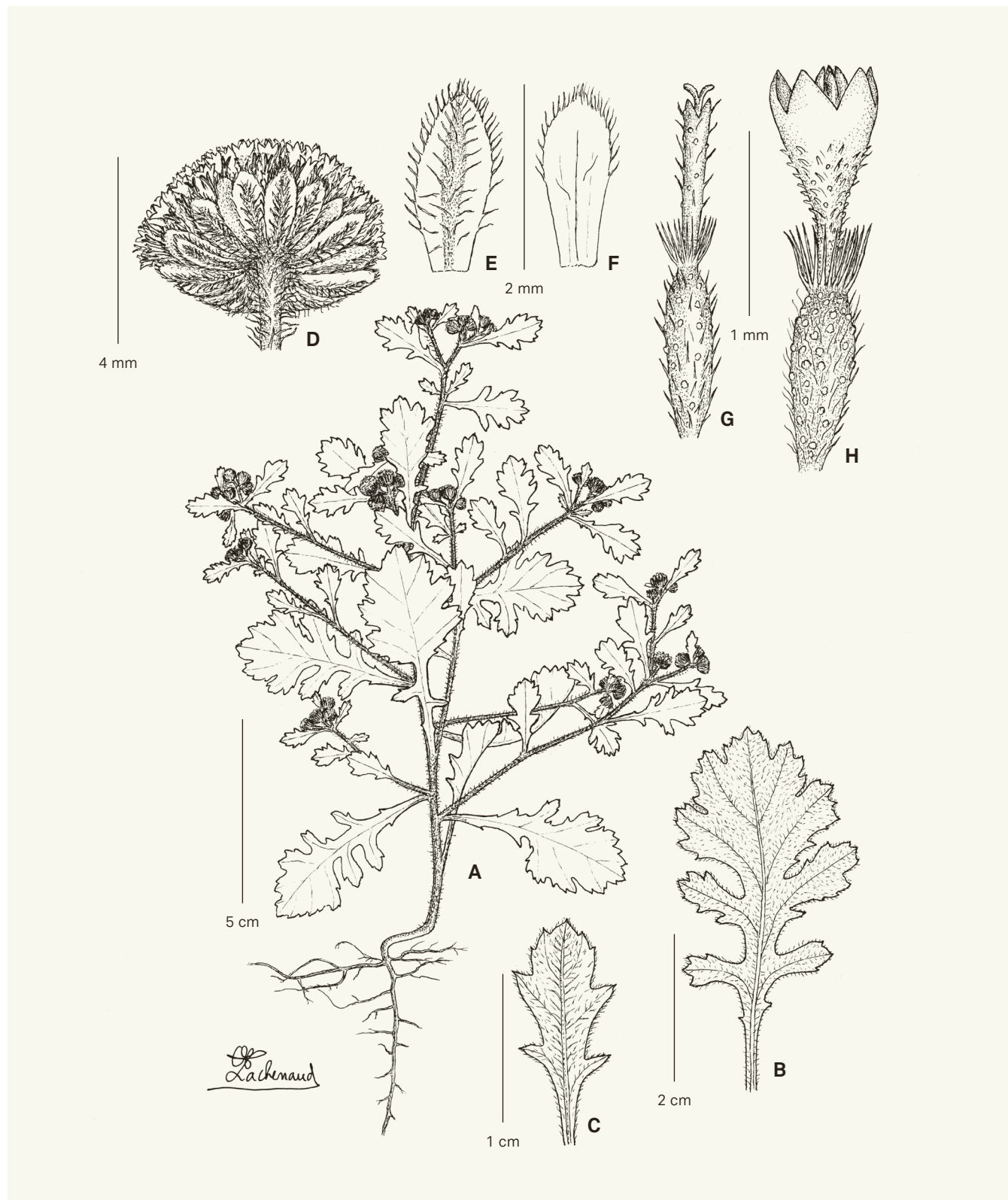
Fig. 2. – Grangea ogoouensis O. Lachenaud & Beentje. A. Plant in flower; B. Basal leaf; C. Upper leaf; D. Capitula; E. Outer phyllary; F. Inner phyllary; G. Outer (female) floret; H. Inner (hermaphrodite) floret. [Bidault et al. 1822, BR] [Drawing: O. Lachenaud]