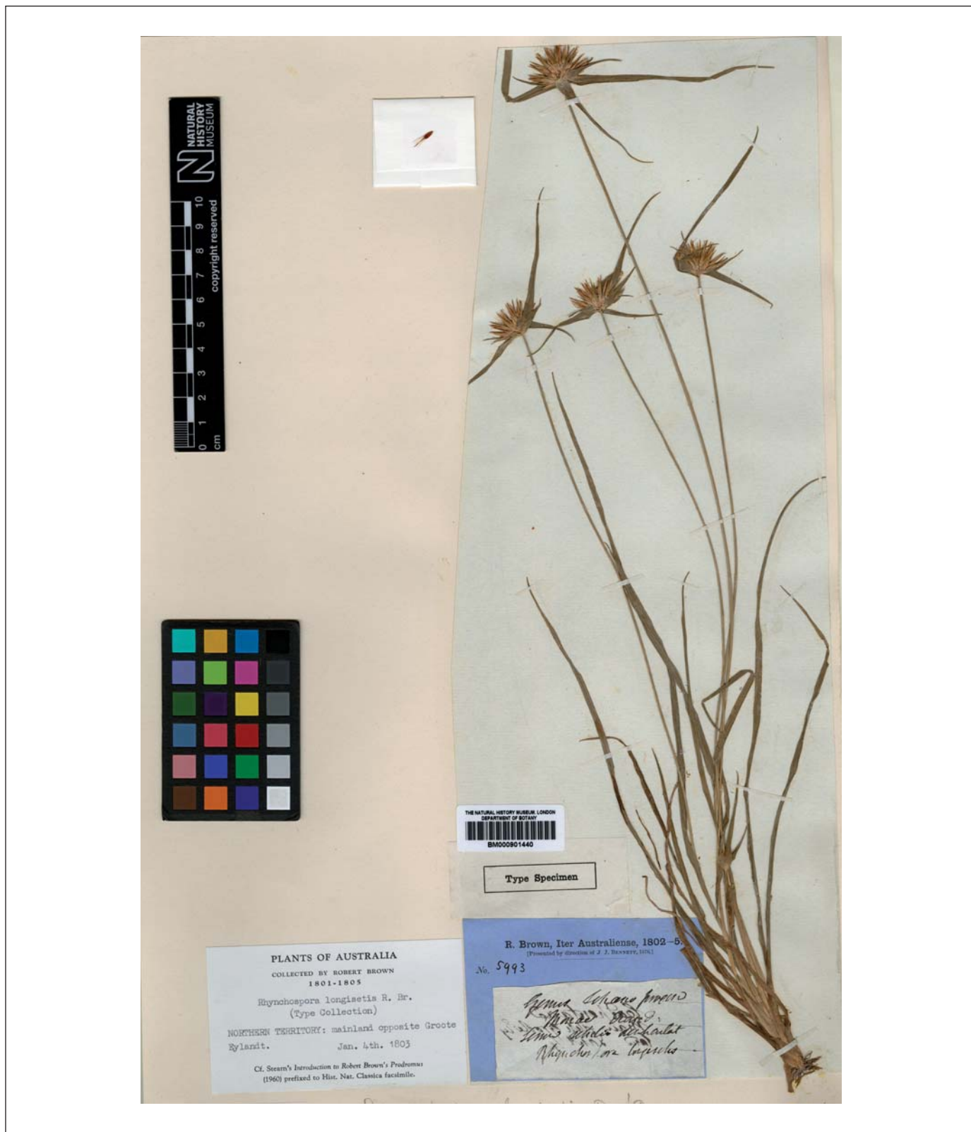
Fig. 2. – Lectotypus of Rhynchospora longisetis R. Br.

[Banks s.n., BM]