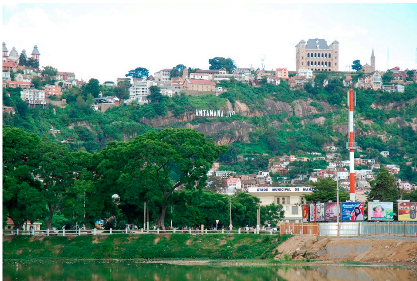
Fig. 2. – Inselberg in the capital Antananarivo with the “Palais de la Reine”.

rich in locally endemic species and possess more habitat specialists than similar habitats in most other tropical regions.