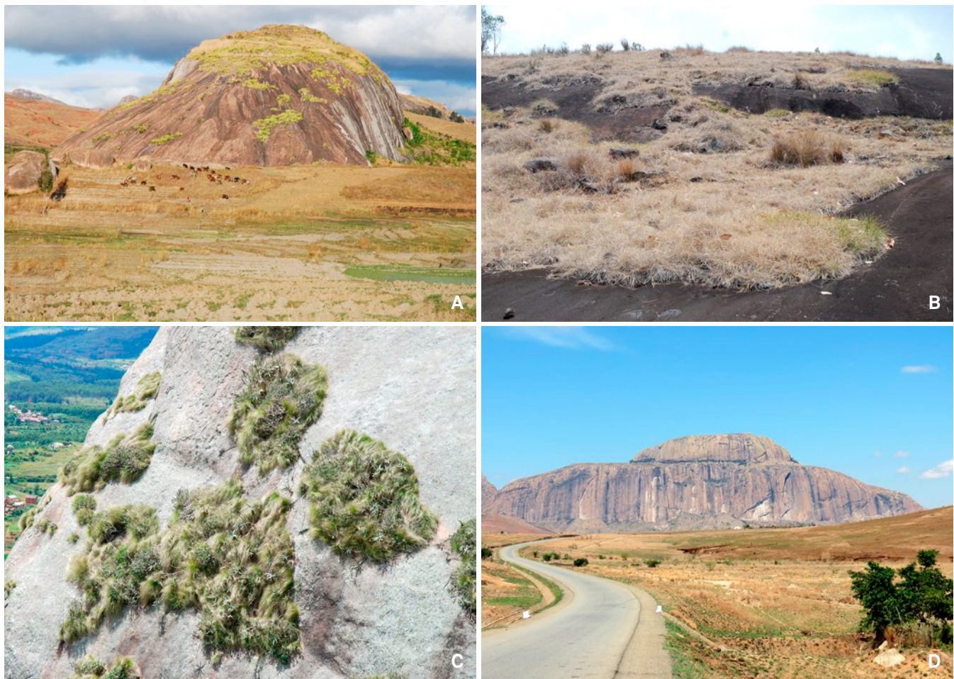
Fig. 6. – A. Inselberg, south of Anja Park (Tangorika) covered with Furcraea foetida (L.) Haw. (Asparagaceae); B. Mat with Styppeiochloa hitchcockii (A. Camus) Cope (Poaceae) near Angavokely; C. Mats formed by Coleochloa setifera (Ridl.) Gilly (Cyperaceae) and steep slopes, south of Fianarantsoa; D. General overview of “Bonnet du Pape, at Voatavo (Fig. 3: n° 26).

exceptions include those within certain National Parks such as Andringitra and Marojejy. In unprotected areas globally, inselbergs often support the last remnants of natural vegetation in a given area. While certain types of human use of inselbergs have occurred for generations and do not seem to have caused severe damage, in recent times human impact appears to have become by far more destructive resulting in steadily growing pressure on these areas, and today most inselbergs in Madagascar exhibit detrimental human impacts. These include: the over-collection of certain useful species which impacts local populations or even threatens local endemics with extinction; use of inselbergs for grazing cattle and goats; uncontrolled bush-fires, usually resulting from the widespread burning of grasslands for agriculture, that may significantly impact the population of individual species and which are also responsible for habitat degradation or destruction as a whole (see WHITMAN et al., 2011 for a study of the influence of fire and water availability