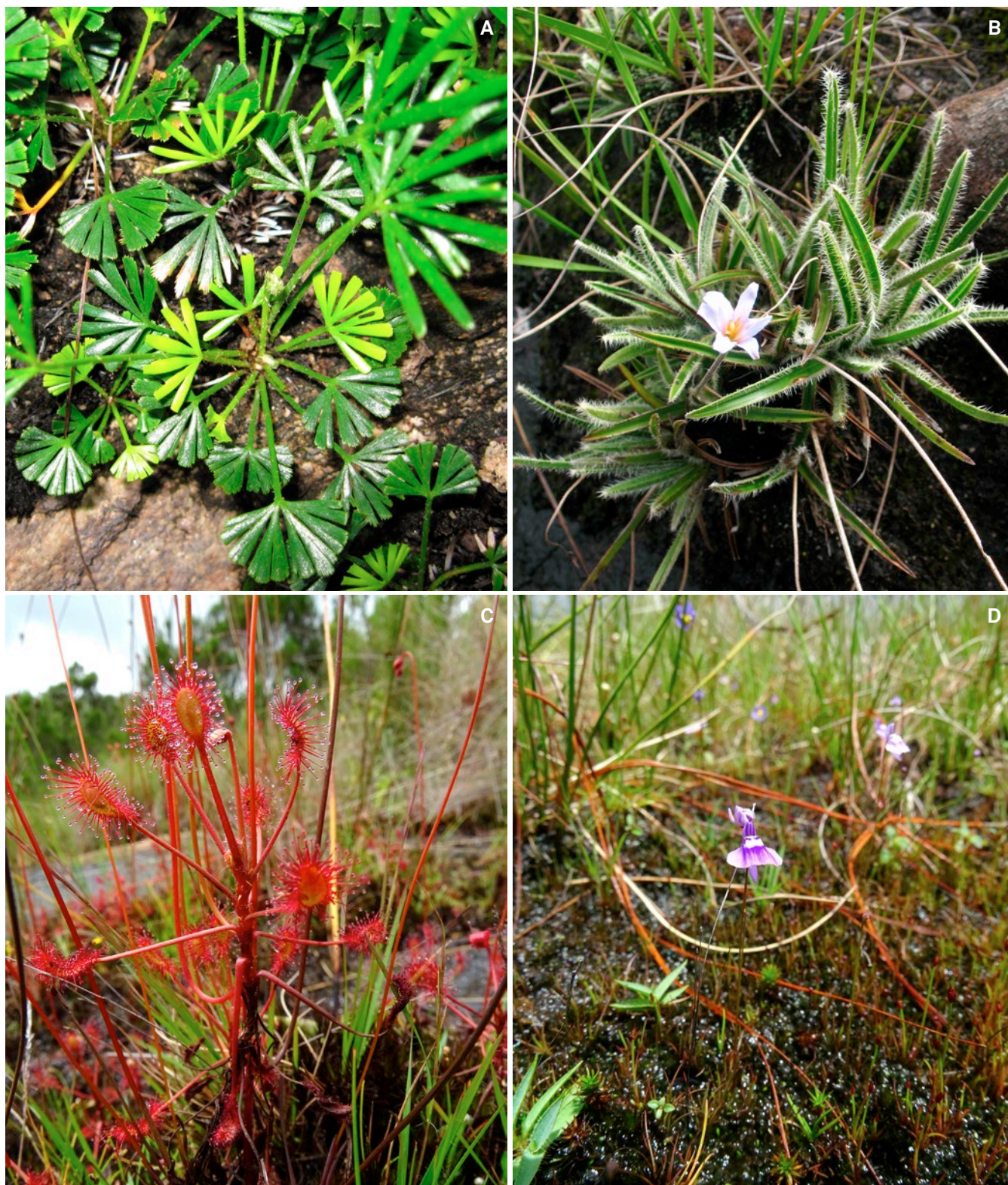
Fig. 5. – A. Actiniopteris dimorpha Pic. Serm. ( Pteridaceae ) a desiccation-tolerant species of fern at Vohidava, Ihosy; B. Xerophyta sp. ( Velloziaceae ) near Anjoman'Akona, south of Ambositra; C. Drosera madagascariensis DC. ( Droseraceae ); D. Utricularia sp. ( Lentibulariaceae ). [ A: Razafindraibe et al. 300; B: Rakotoarivelo et al. 287; C: Rabarimanarivo et al. 745; D: Rabarimanarivo et al. 705]