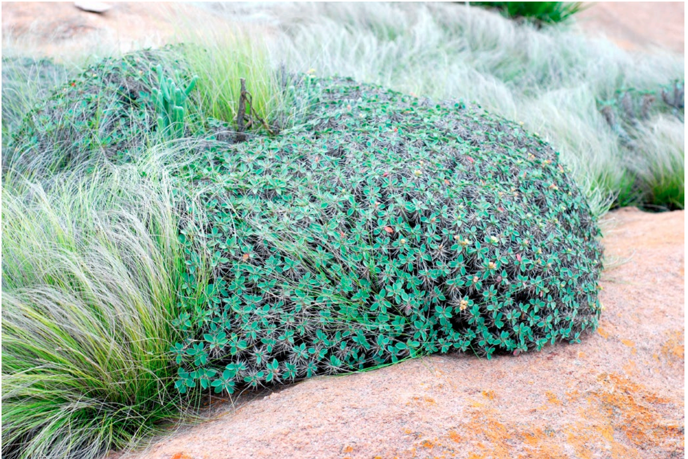
Fig. 4. – Euphorbia horombensis Ursch & Leandri ( Euphorbiaceae ) a succulent on open rocks at Vohitsanavo inselberg, Anja Park (Fig. 3: n° 23). [Razafindraibe et al. 278]

(B.S. Williams) Schltr., Angraecum pseudofilicornu , Oeceoclades calcarata (Schltr.) Garay & P. Taylor, Sobennikoffia humbertiana ) were present.