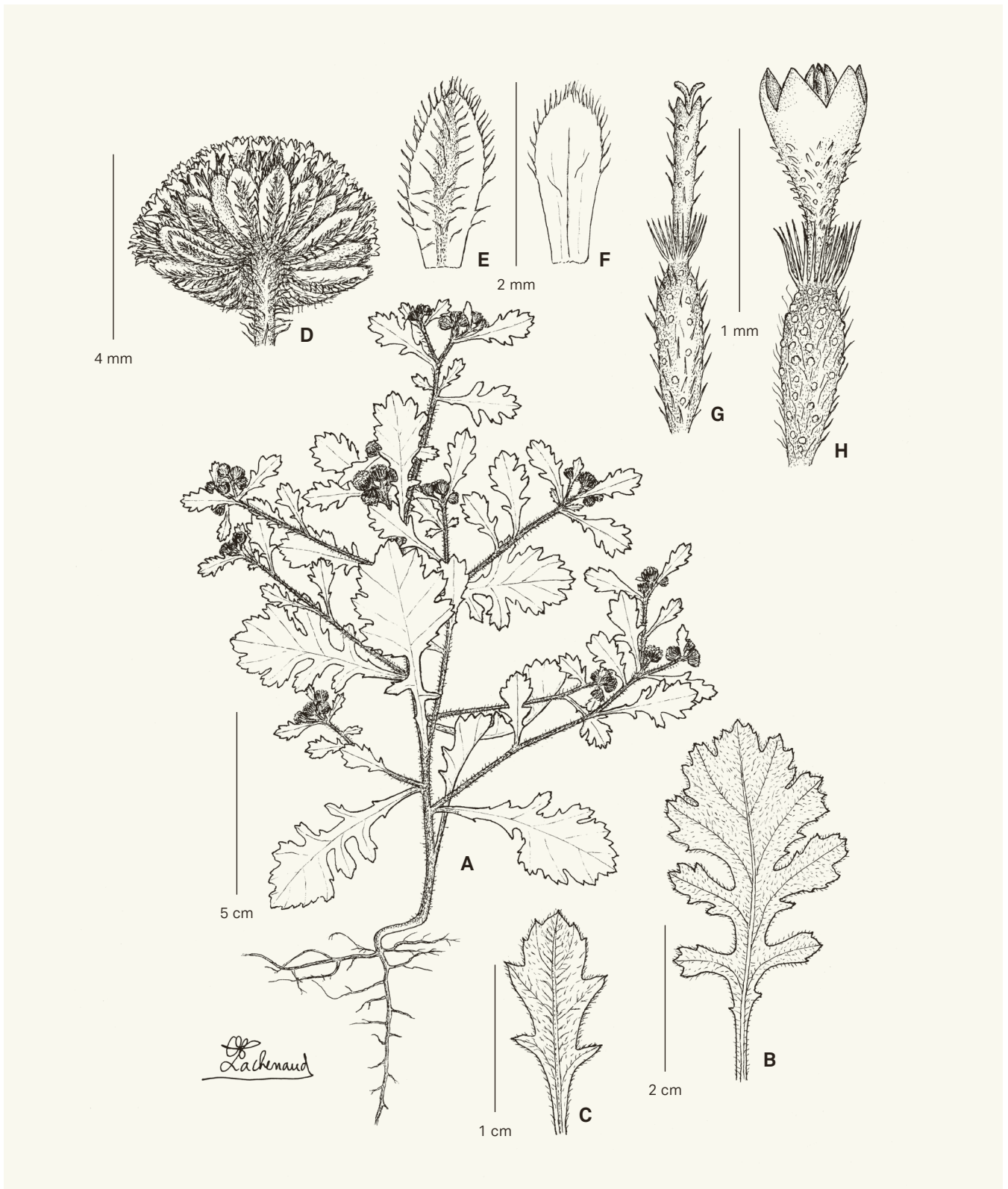
Fig. 2. – Grangea ogoouensis O. Lachenaud & Beentje. A. Plant in flower; B. Basal leaf; C. Upper leaf; D. Capitula; E. Outer phyllary; F. Inner phyllary; G. Outer (female) floret; H. Inner (hermaphrodite) floret. [Bidault et al. 1822, BR] [Drawing: O. Lachenaud]