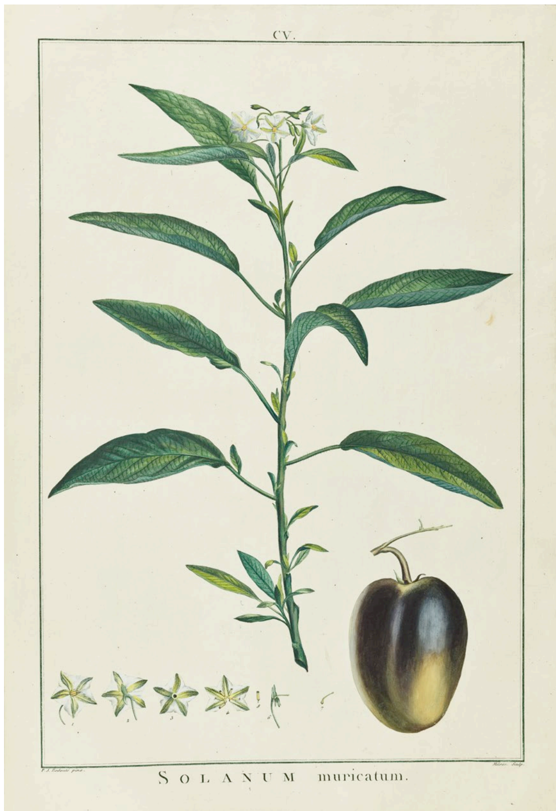
Fig. 3. – Solanum muricatum Ait. Copper engraving based on P.-J. Redouté, no date. [ L'Héritier's Reliquiae ] [Bibliothèque, Conservatoire et Jardin botaniques de Genève]