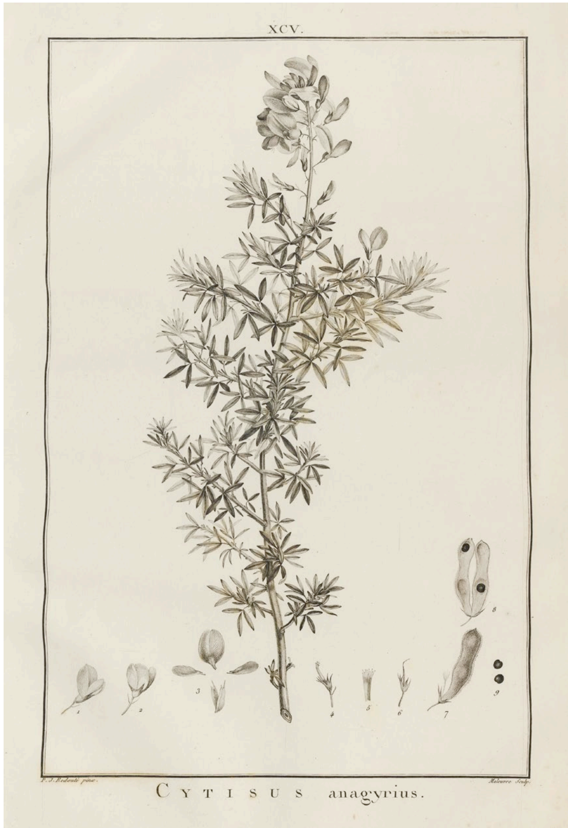
Fig. 5. – Cytisus anagyrius L'Hér. (= Adenocarpus hispanicus (Lam.) DC.). Copper engraving based on P.-J. Redouté, no date. [Tabulae ineditae: tab. 95]