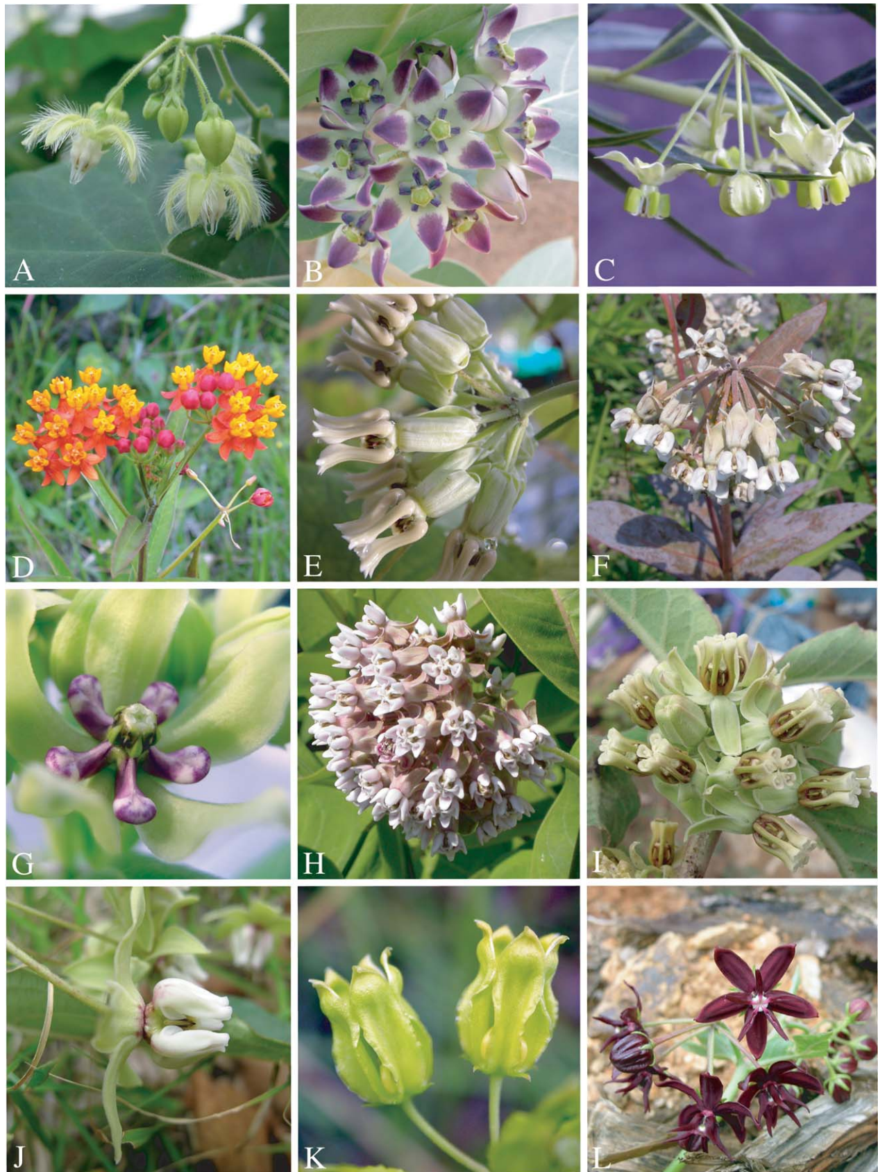
FIG. 1. Diversity of floral morphology in Asclepias and related genera, illustrated by representatives of major clades. A. Pergularia daemia , outgroup (cultivated, seed from Tanzania). B. Calotropis procera , outgroup (cultivated). C. Gomphocarpus fruticosus , clade C (cultivated, seed from Namibia). D. Asclepias curassavica , clade F (Querétaro, Mexico). E. Asclepias subulata , clade I (cultivated, seed from Sonora, Mexico). F. Asclepias glaucescens , clade J (Michoacán, Mexico). G. Asclepias viridis , clade K (cultivated, seed from Mississippi, U. S. A.). H. Asclepias syriaca , clade L (Virginia, U. S. A.). I. Asclepias oenotheroides , clade M (Oaxaca, Mexico). J. Asclepias auriculata , clade N (Oaxaca, Mexico). K. Asclepias pedicellata , clade O (Florida, U. S. A.). L. Asclepias melantha , clade P (Oaxaca, Mexico).