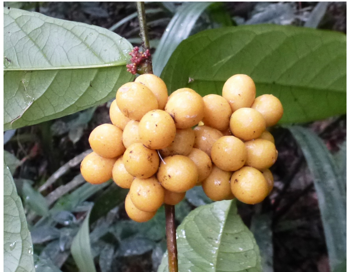
Fig. 1. Decorsella paradoxa showing berry-like seeds from two fruits. – Photographed by Carel Jongkind in Liberia from Jongkind & al. 11998.

Decorsella arborea Jongkind, sp. nov. – Fig. 2A–N. Holotype: Gabon, Ngounié, Missionary Station at Mouya-