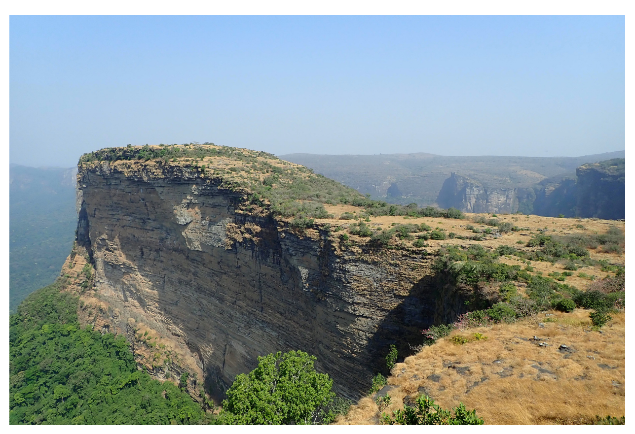
Fig. 6. Submontane wooded grassland vegetation in the Kounounkan Massif. Gladiolus mariae was collected on this 1020 m high hill and was also observed there, growing on vertical sandstone cliffs. In some years the vegetation on the hill is not subject to the annual dry season fires because it is separated from the main plateau by a narrow, 350 m long canyon. – Photograph taken on 7 Feb 2019 by Xander van der Burgt.

In Afromontane shrubland, fire has often favoured the spread of grasses at the expense of the shrubs (White 1983: 49). Anthropogenic fires are usually ignited in the dry season when lightning-ignited fires would not normally occur (Archibald & al. 2012) and have a large influence on species composition and structure of the vegetation (Bond & al. 2005; Staver & al. 2011).