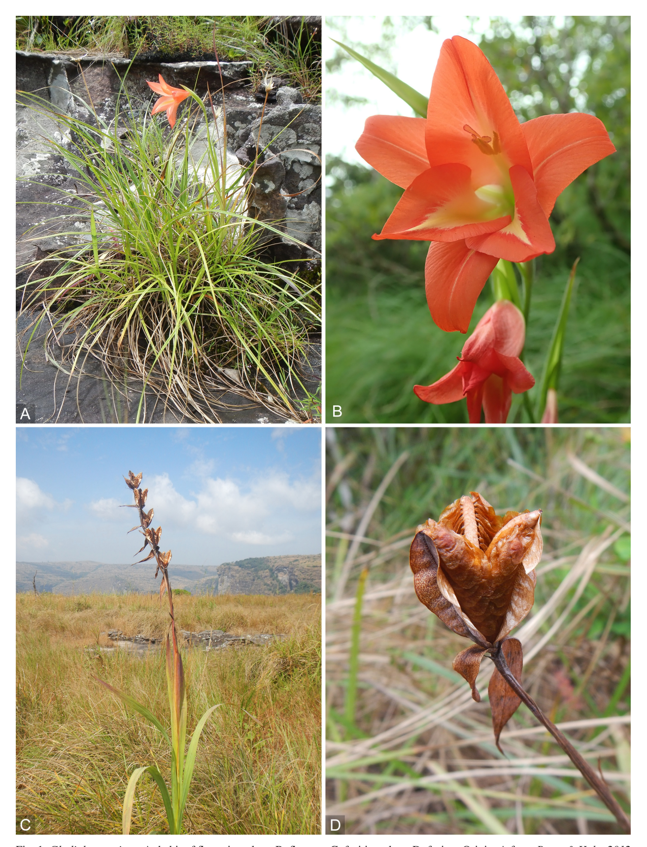
Fig. 1. Gladiolus mariae – A: habit of flowering plant; B: flowers; C: fruiting plant; D: fruit. – Origin: A from Burgt & Haba 2012 (type gathering); B from Burgt 2207 ; C, D from Burgt 2161 .