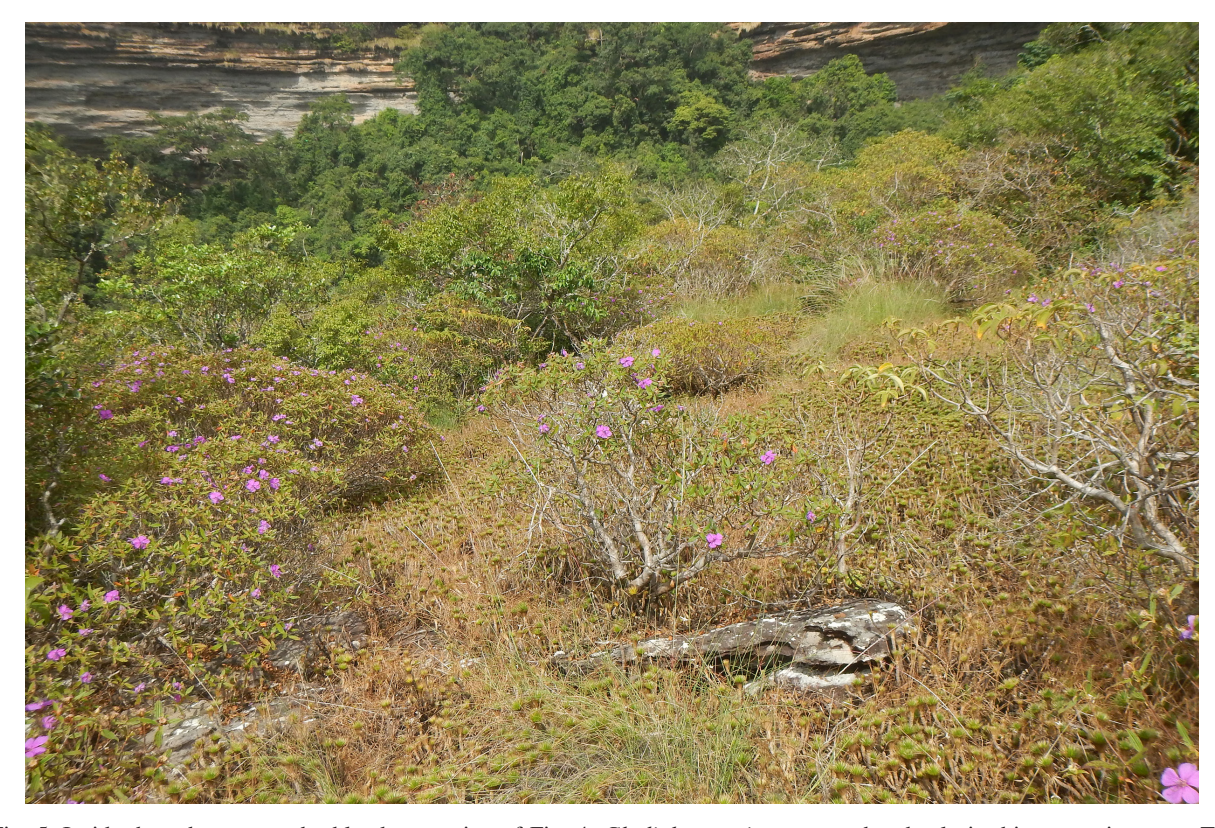
Fig. 5. Inside the submontane shrubland vegetation of Fig. 4. Gladiolus mariae occurs abundantly in this vegetation type. The vegetation is dominated by shrubs that are not resistant to fire: Cailliella praerupticola (in flower), Dissotis leonensis (both Melastomataceae ) and Microdracoides squamosa ( Cyperaceae ). Grasses ( Poaceae ) are infrequent; the only grass visible is Rhytachne perfecta , front and centre right.