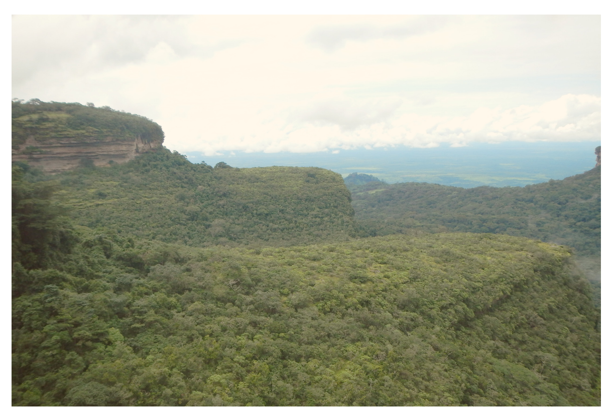
Fig. 4. Submontane forest and shrubland vegetation at 850 m altitude in the Kounounkan Massif. Both vegetation types are dominated by species that are not resistant to fire. The shrubland vegetation blends gradually into the surrounding submontane forest.