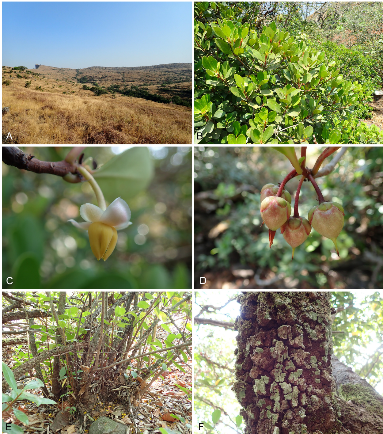
Fig. 2. Ternstroemia guineensis – A: habitat, submontane gallery forest in sparsely wooded grassland; B: habit; C: flower; D: fruits; E: base of a multi-stemmed shrub; F: bark of a tree, trunk c. 18 cm in diam. – Photos: Republic of Guinea, Kounounkan Massif, Feb 2019, Xander van der Burgt.

concave, thick, leathery, outer surface wrinkled when dry, unequal, outer pair suborbicular, c. 4.5 \times 5.2 mm, leathery, margin scarious, 0.5–1 mm wide, erose, apex rounded or retuse, sometimes with mucro 0.3–0.4 mm long, inserted adaxially below margin; inner sepals ovate, c. 6.5 \times 6 mm, mucro absent, margin as outer sepals. Petals 5 (or 6), yellow or yellowish white, together forming a short cylinder enclosing stamens, petals imbricate, connate in basal \frac{1}{4} (for 1.7–2 mm, Fig. 1F, 2C), each nar-