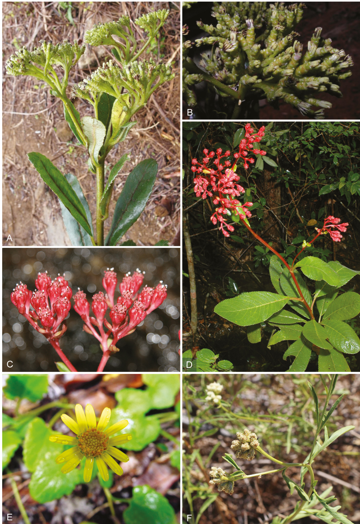
Fig. 1. Representatives of the Malagasy endemic Athroismeae – A, B: Apodocephala sp.; C, D: Lowryanthus rubens ; E: Anisopappus longipes (Cass.) Wild; F: Athroisma proteiforme (Humbert) Mattf. – Photographs by P. Antilahimena (A, B; MBG-Madagascar, CC-BY-NC-ND © 2021), K. Kainulainen (C), P. P. Lowry II (D; MBG, CC-BY-NC-ND © 2021), F. Ratovoson (E; MBG-Madagascar, CC-BY-NC-ND © 2021) and L. Ramon (F; CC-BY-NC-ND © 2021).