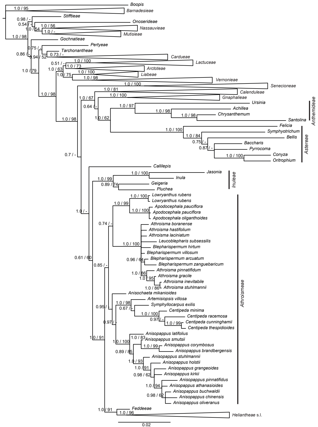
Fig. 2. Bayesian fifty-percent majority-rule consensus tree from an analysis of the Asteraceae ndhF dataset. Numbers above branches indicate posterior probability (PP) and bootstrap support (BS) values, bootstrap support values < 50 are indicated by a dash.