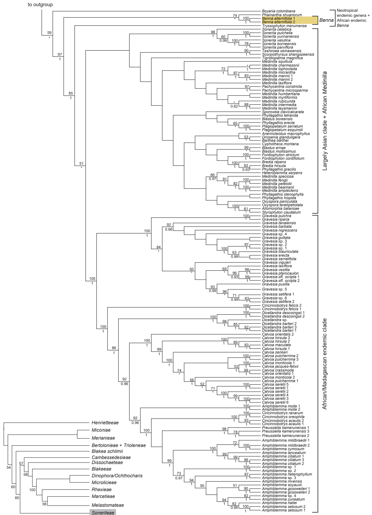
Fig. 1. Phylogeny showing the position of Benna alternifolia within the tribe Sonerileae.