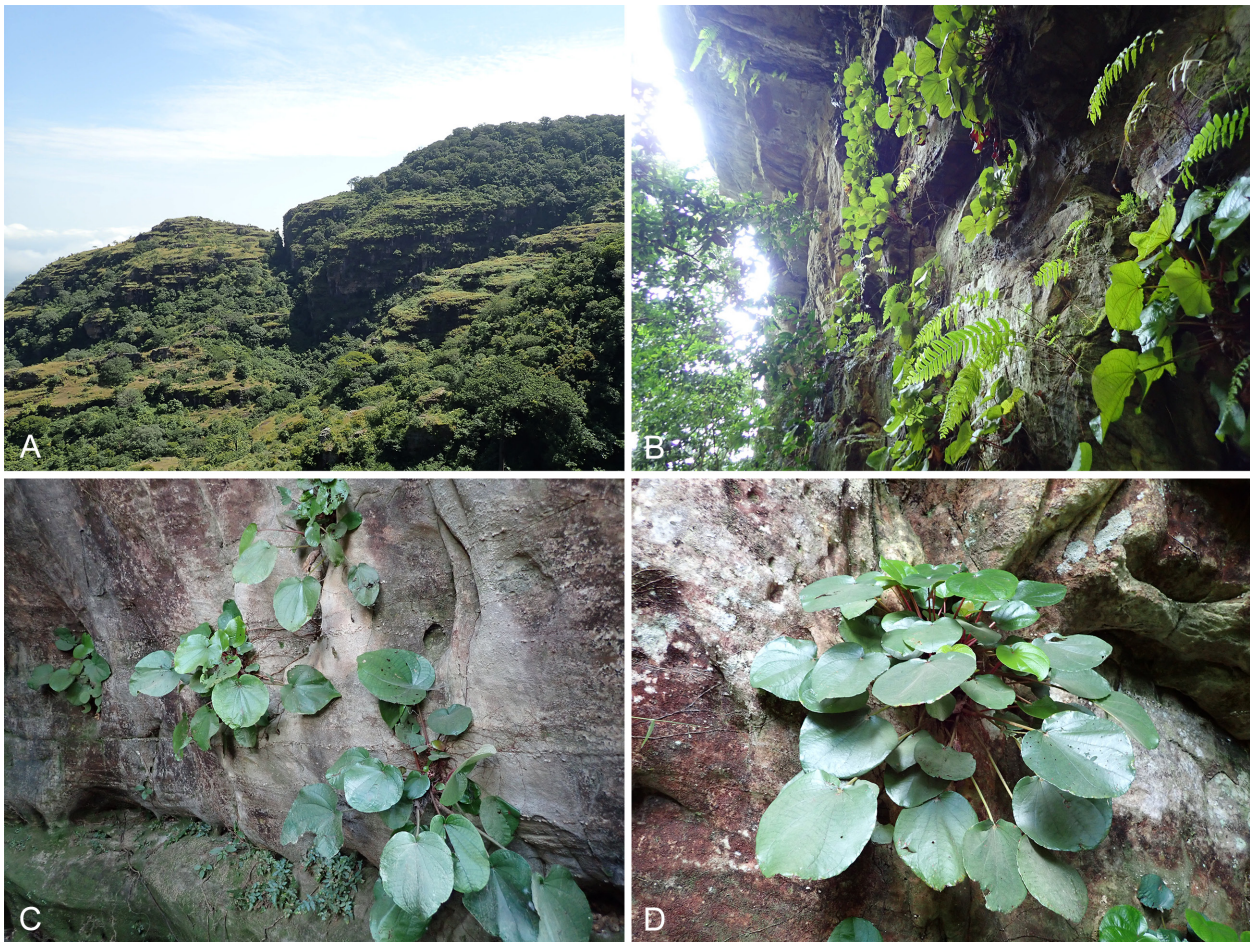
Fig. 3. Benna alternifolia – A: the largest population was found in a deep canyon, of which the upper part is visible at the centre of the photograph, on a 1040 m-high hill on the Benna Plateau; B: plants in their habitat, on vertical rock in deep shade, under overhanging rocks, out of reach of falling rain drops, but within reach of permanently seeping water; C: group of four plants; D: single plant. – Origin: A, C from Burgt & al. 2274 (type gathering); B from Burgt & al. 2323; D from Burgt & Haba 2333.

the other African (including Madagascan) Sonerileae genera (Fig. 1), all of which were sampled in the present study. They are weakly supported (BS 57%) as sister to the South American genus Phainantha . Of the six currently accepted American Sonerileae genera, only three genera were sampled in the present study.