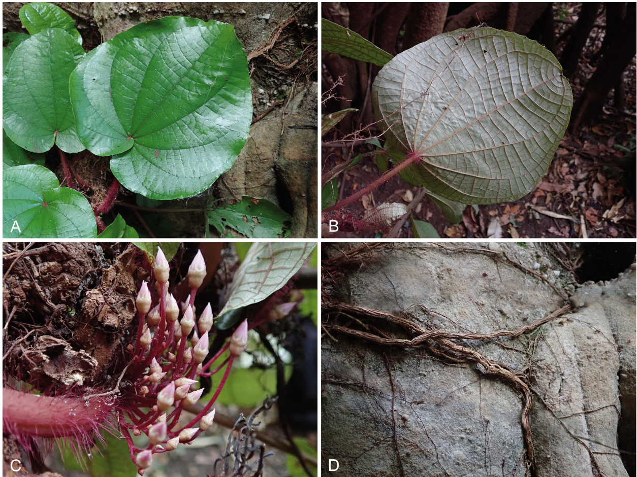
Fig. 4. Benna alternifolia – A: leaf upper surface; B: leaf lower surface; C: inflorescence with flower buds; D: roots. – Origin: A, D from Burgt & Haba 2333; B, C from Burgt & al. 2274 (type gathering).

collections from the Benna Plateau, Burgt & al. 2274, 2323 and Burgt & Haba 2333, represent a new, monotypic genus. The genus is named Benna Burgt & Ver.-Lib. and the species is named Benna alternifolia Burgt & Ver.-Lib. in the taxonomy section of the present manuscript.