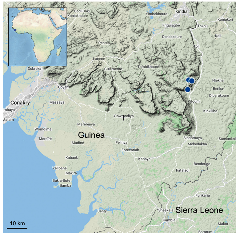
Fig. 5. Distribution of Benna alternifolia , blue dots.

Distribution — Benna alternifolia is endemic to Guinea (Fig. 5) and occurs in Forécariah Prefecture near border with Kindia Prefecture, in canyons of the Benna Plateau near villages Dalonia and Gombokori.