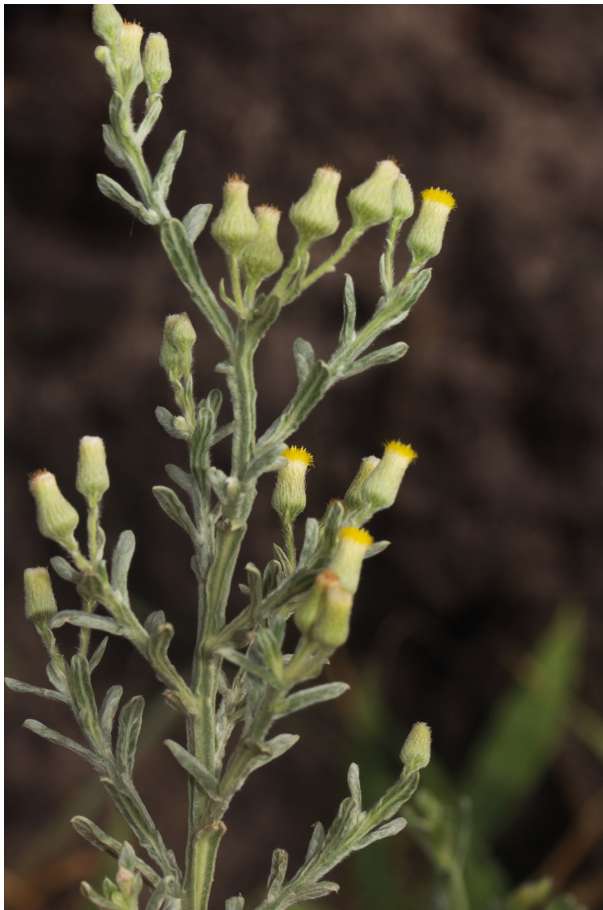
Fig. 6. Galgera decurrens – Namibia, Caprivi Strip, Bukalo, 31 Jan 2018.

This genus is a member of the Inuleae–Plucheinae related to, e.g., Nicolasia S. Moore and Doellia Sch. Bip. ex Walp. in the large “Pluchoid” clade mentioned above (Nylander & Anderberg 2015; Fig. 2). Laggera species (Anderberg 1991) have winged stems or at least long decurrent leaf bases, florets with purple or pink corollas, and styles with obtuse sweeping-hairs extending below the bifurcation. Nylander & Anderberg (2015) found that Laggera was polyphyletic as presently circumscribed because one of its species, viz. L. decurrens , belongs in a different clade within the subtribe. Apart from its distant relationships to other species of Laggera , L. decurrens also differs from them in morphology by having capitula with yellow corollas, tailed anthers with polarized endothelial tissue wall thickenings, and styles with acute sweeping-hairs ending above the bifurcation. It is here found as sister to Antiphiona close to the Geigeria–Ondetia and Calostephane–Pegolettia clades (Fig. 2). In Nylander & Anderberg (2015) the Geigeria–Ondetia pair is sister to Antiphiona–Laggera decurrens . Like Antiphiona , these were formerly members of the Inuleae–Inulinae . They have florets with yellow corollas (purple with yellow tips in Antiphiona ), styles with acute sweeping-hairs ending above the bifurcation (below in Geigeria Griess.) and polarized endothelial tissue. In these respects, they correspond well with the character