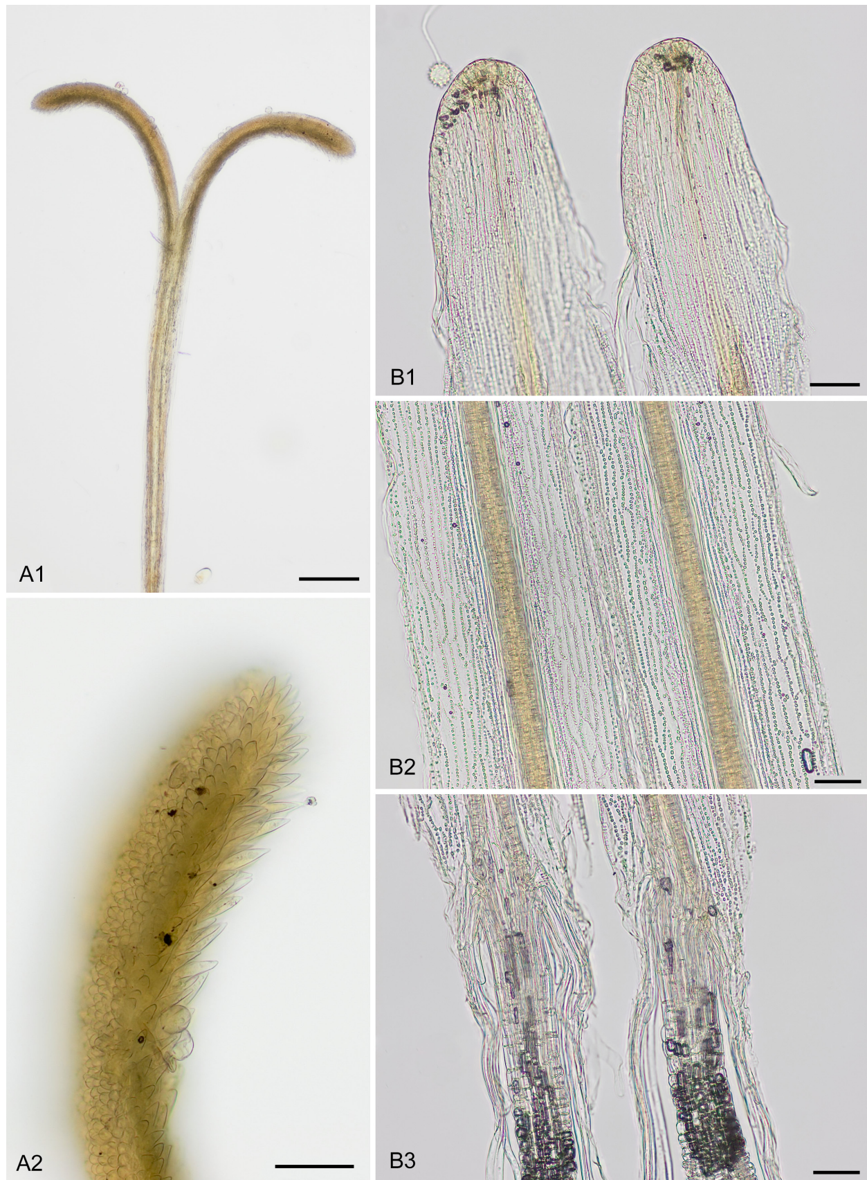
Fig. 5. Viccoia anisopappoides , floral microcharacters – A: style; A1: style branches with sweeping-hairs confined to distal portion of branches; A2: style branch showing acute sweeping-hairs; B: anthers; B1: rounded anther apex; B2: endothecial tissue with radial wall-thickenings; B3: well-developed anther tails. – Scale bars: A1 = 200 µm; A2, B1–3 = 50 µm. – A, B: from the holotype, PH & al. 6033 (S S07-16156), photographs by Lars Hedenäs.