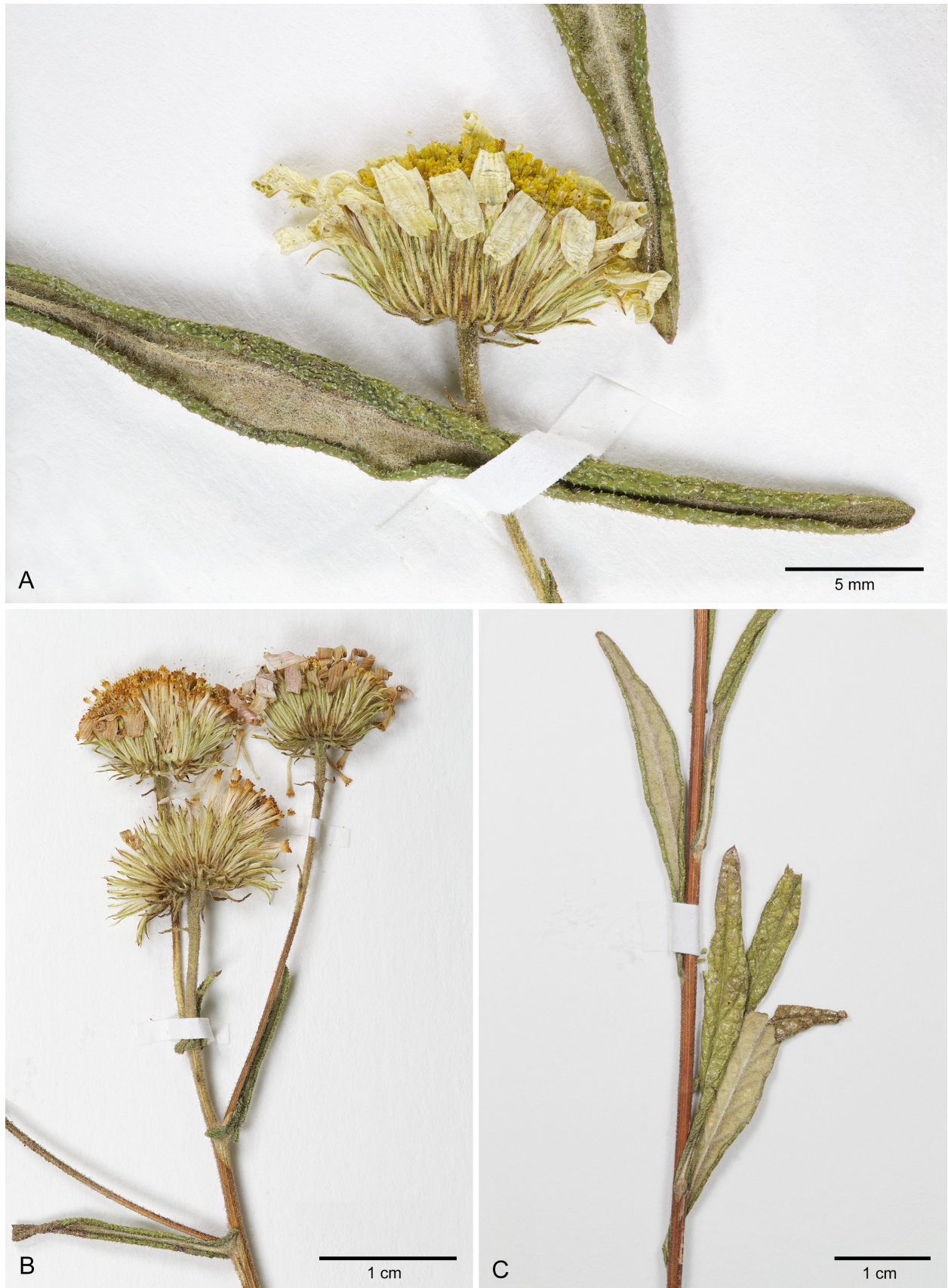
Fig. 4. Vicoa anisopappoides – A: capitulum and revolute leaves; B: synflorescence with three capitula; C: xeromorphic leaves with bullate, scabrid upper surface, revolute margins and white tomentose lower surface. – A–C: from the holotype, PH & al. 6033 (S S07-16156), photographs by Jennifer Kearey.