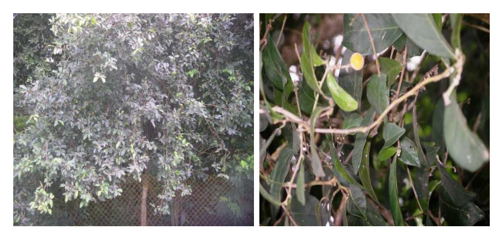
D. madagascariensis Poir [syn. D. guineense (DC.) Keay] A close-up of D. madagascariensis , showing the fruit D. gelonioides (Roxb.) Engler [syn. Moacurra geloniodes Roxb.] represents another of the less toxic species and it occurs in wet evergreen forests of South East Asia. In the Philippines, it is reported as treatment for amenorrhea (Fang et al. 2006).

Recent separate investigations of D. madagascariensis and D. gelonioides have led to the isolation and characterization of a novel and unique class of triterpenoids in which a 2-phenylpyrano moiety is annellated to ring A of a dammarane-triterpene skeleton. Biogenetically, their basic structure is characterized by the addition of a C<sub>6</sub>-C<sub>2</sub> unit, which might probably be derived from the shikimic acid pathway, to a 13, 30-cyclodammarane-type skeleton (Figure 1). Thirteen dichapetalins, named dichapetalins A – M, have so far been isolated from these two species of the Dichapetalaceae (Achenbach et al. , 1995; Addae-Mensah et al. , 1996; Fang et al. 2006; Osei-Safo et al. 2008).