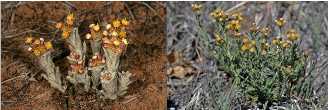
Figure 9.4. Helichrysum dregeanum.