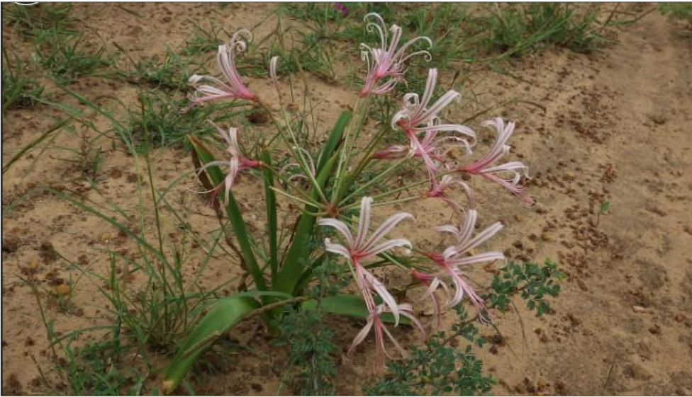
Figure 9.3. Nerine laticoma , showing conspicuous flowers and sandy red, soil habitat.