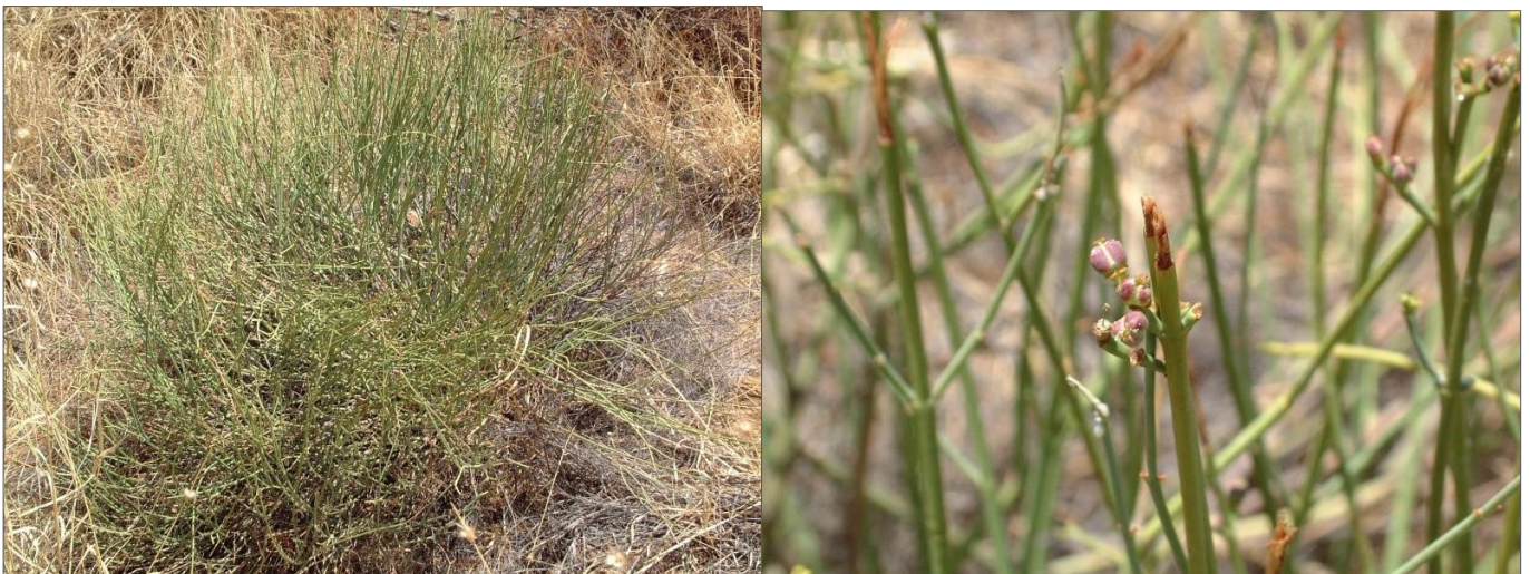
Figure 9.8. Euphorbia spartaria