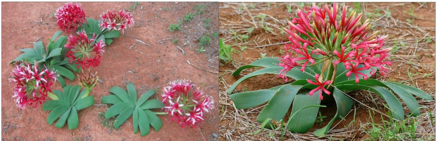
Figure 9.11. Ammocharis coranica , showing bright red and pink flowers and flat, fleshy leaves usually colonising bare soil patches.

Ammocharis coranica ( Figure 9.1 ) is widespread and relatively common throughout the interior of South Africa. It is however, recognized as being threatened in the Free State (Todd and Skowno, 2015; Gotze, 2018), although it has been excluded from the Free State Biodiversity Management Plan, which provides detailed information on all other threatened plant species in the province (Collins, 2016). The document indicating that it is regionally protected dates back to the late 1960's (FSNCO, 1969). It is a member of the Amaryllis family, and as such is protected. The plant occurs in gaps in the sward where it is able to spread its broad, fleshy leaves across the soil surface with minimal competition from grasses. They are often found in loose colonies where they are able to exploit localised bare patches that fulfil their habitat requirements. No A. coranica plants were located along the walked transect, although this does not preclude the likelihood of them being present. One can conclude, however, that their abundance is low.