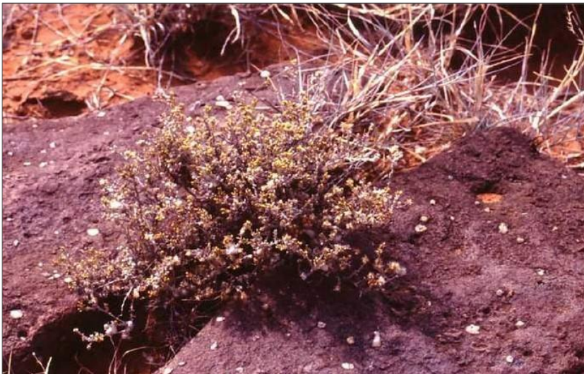
Figure 9.6. Helichrysum luciloides