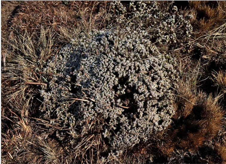
Figure 9.7. Helichrysum caespititium