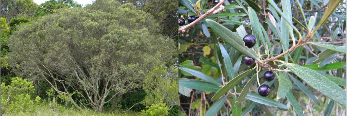
Figure 9.11. Olea europa subs. africana