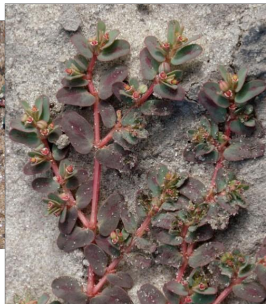
Figure 9.10. Euphorbia inaequilatera var. inaequilatera