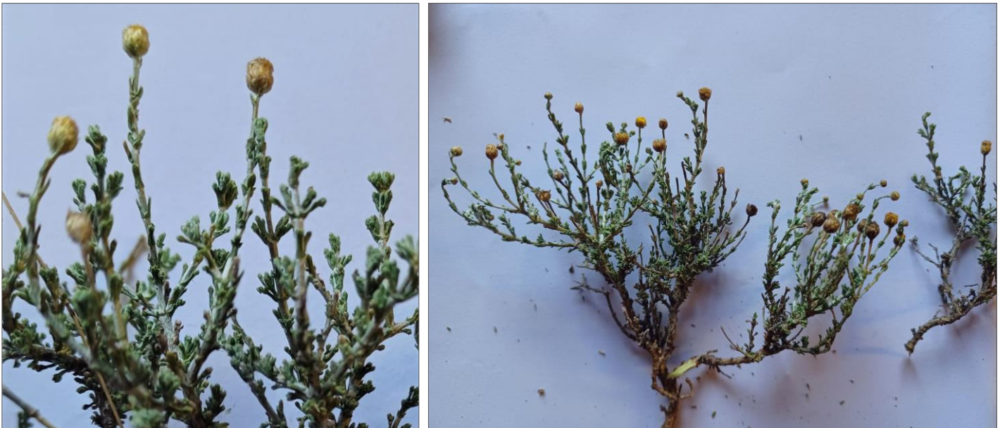
Figure 9.2. Pentzia oppositifolia showing fleshy, oppositely-arranged leaves (left) and growth form (right).

P. oppositifolia is an indicator of localised veld degradation from heavy utilization and is found in small groups to large colonies on exposed soils. Pentzia species can root where the branches touch the soil, leading to clonal spread (Esler, 1999). Overgrazing has caused a reduction in sward height and basal vigour, and this species has been able to colonise the gaps. They are strongly associated with shallow soils over dolerite or hard plinthite and multiple termite mounds. The species was not found in large numbers within the Braklaagte site, and the Vaal Vet Sandy Grassland is likely to be marginal habitat due to the deep soils and taller, more robust sward.