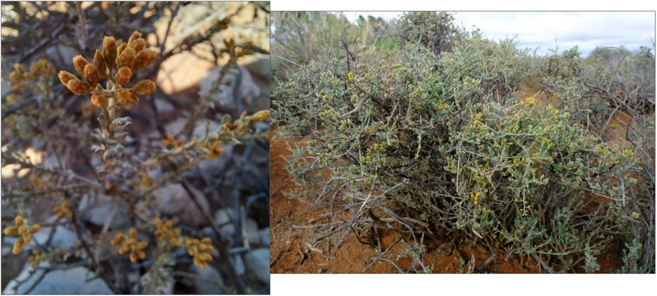
Figure 9.5. Helichrysum pentzioides (Photos: Kevin Koen (left); Nick Helme (right)).