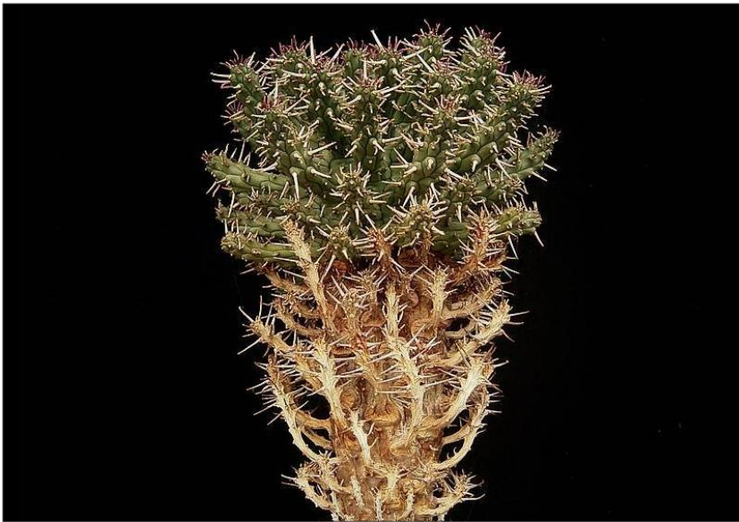
Figure 9.9. Euphorbia arida