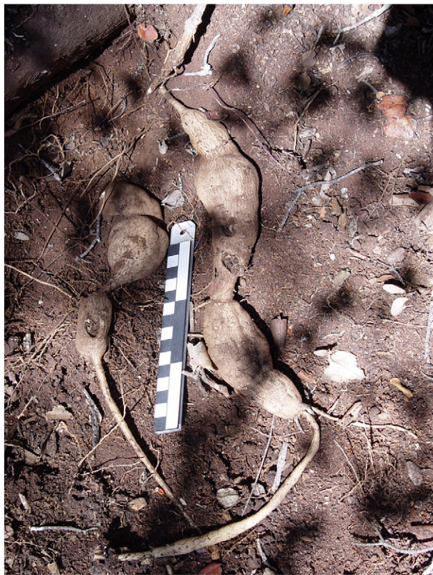
Fig. 3. Chlorocyathus monteiroae : subterranean roots and tubers.

R. monteiroae (Oliv.) N.E. Br.: 533 (1907); Meve et al.: 226 (2002); Venter: 212 (2003).