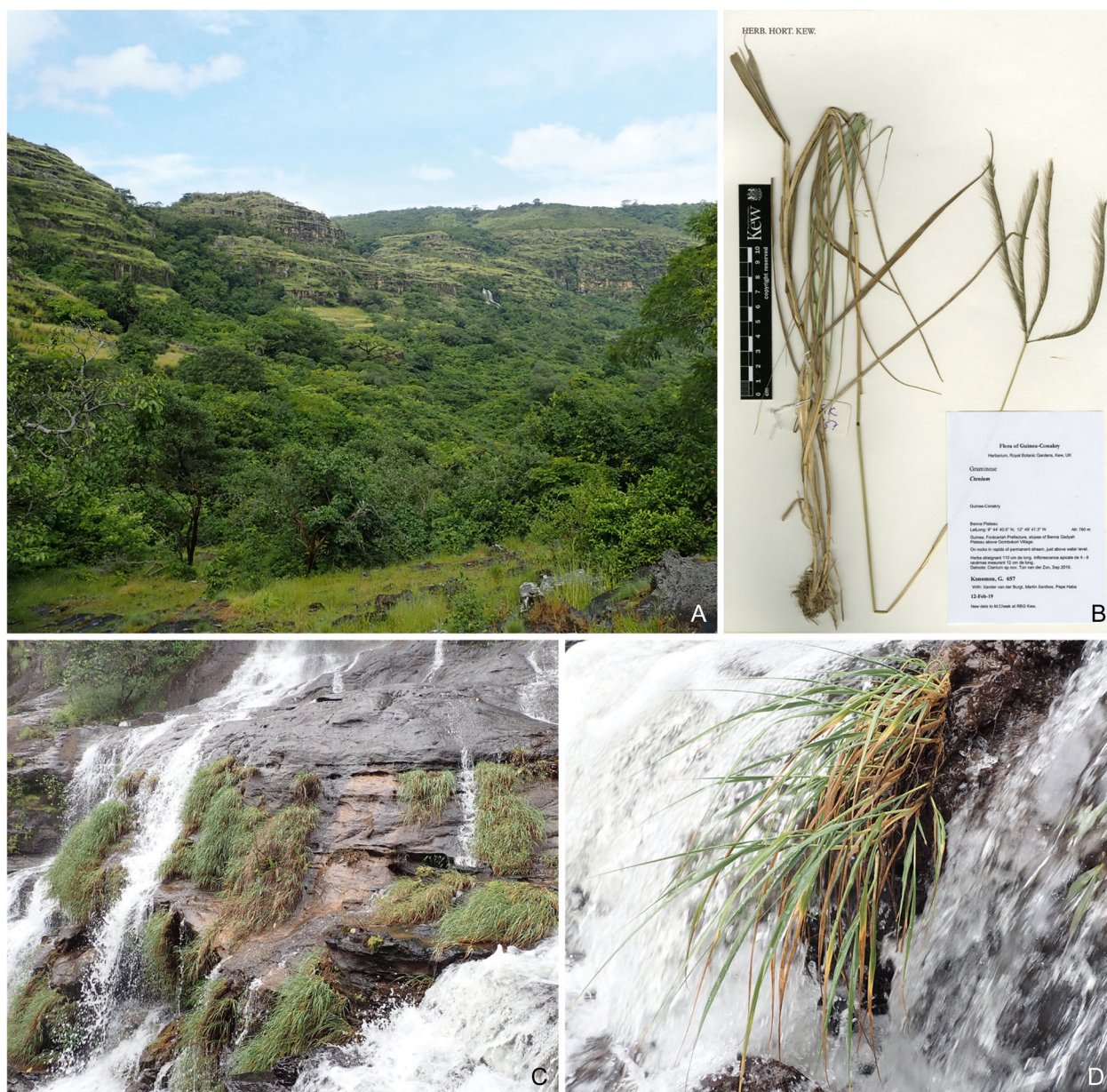
Fig. 1. Ctenium bennae . A the species was only found in the waterfall seen in the distance, 5 Nov. 2019; B unmounted herbarium specimen of Konomou 657; C habitat, sandstone rocks in the rapids of a permanent stream, 2 Nov. 2019; D close up of the species growing in the rocks, 2 Nov. 2019.

RECOGNITION. Ctenium bennae has the most reduced spikelet structure among the African species of Ctenium , with the first two florets reduced completely