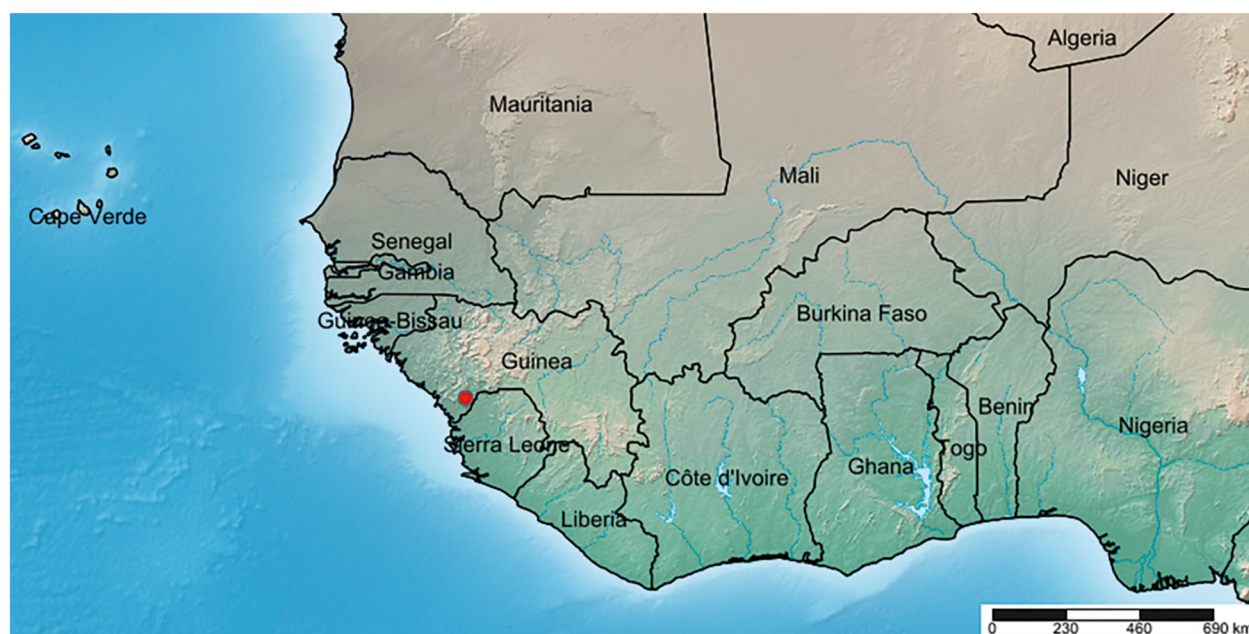
Map 1. Distribution of Ctenium bennae (●) in Africa.

continue to be made e.g. Ternstroemia guineensis Cheek (Ternstroemiaceae; Cheek et al. 2019) and Trichantheum tenerium Xanthos (Poaceae; Xanthos et al. 2020). The Kounounkan Massif and Plateau represents an area rich in endemic species and is proposed as a Tropical Important Plant Area or TIPA (Darbyshire et al. 2017; Couch et al. 2019). The precise location of the Benna Plateau had not yet been discovered when Couch et al. (2019) was published, and therefore the Benna Plateau is not listed as a TIPA in that publication.