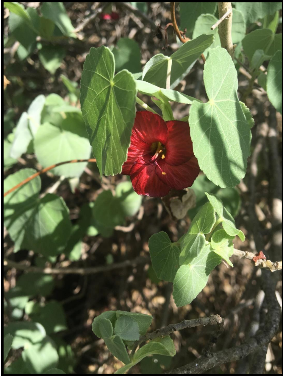
Ko`oloa `ula, Abutilon menziesii