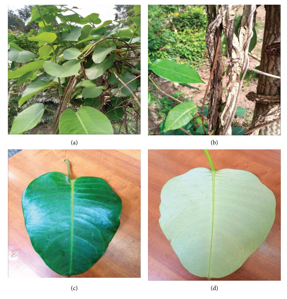
FIGURE 1: (a). P. nigrescens full plant (b). Climbing stem of P. nigrescens . (c). Adaxial (Upper surface) of leaf (d). Abaxial (Lower surface) of leaf. a-d: Source: A photograph of a full plant of P. nigrescens , including the climbing stem, adaxial leaf, and abaxial leaf, at the Centre for Plant Medicine Research (CPMR) arboretum in Mampong-Akuapem, Ghana.