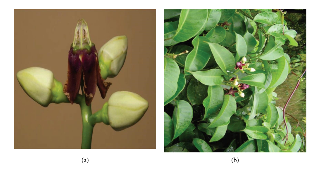
FIGURE 2: (a). P. nigrescens flowering. (b). P. nigrescens flowers on the plant. Figure 2a: Figure 2b: