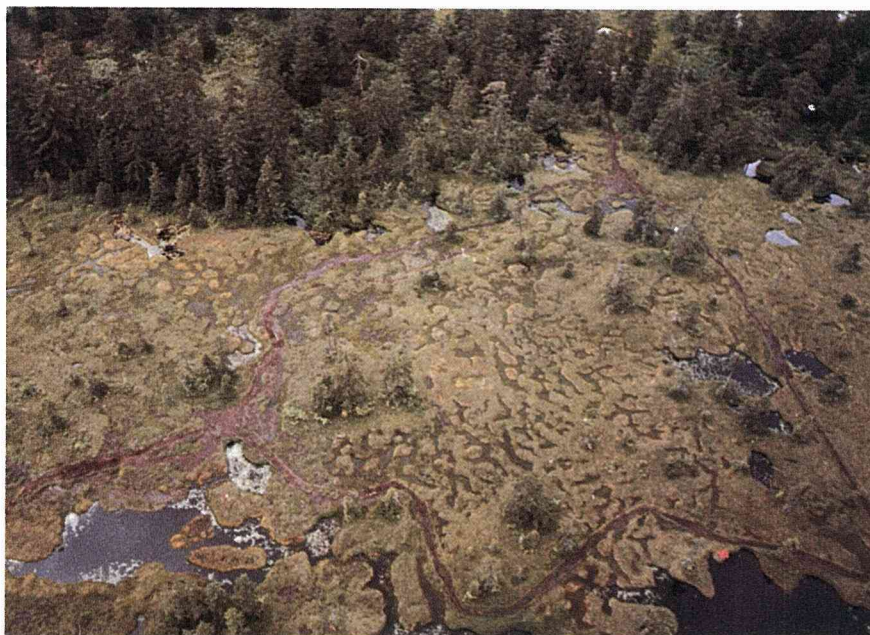
Photo 2. A bird's-eye view of Higashi-Ohnuma pond area of Ukijima mire from a research balloon at a height of ca. 300 m. Bare walk surrounds the regeneration complex composed of the Scheuchzerio-Rhynchosporium albae boreale , the Sphagnetum papillosum , and the Sphagnetum fuscum . (by courtesy of the PASCO, 3 Aug. 1985).