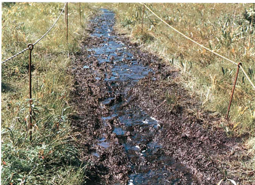
Photo 3. A muddy path becomes the water course after a shower.