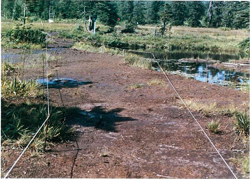
Photo 4. Barren vegetation on the shore of Ohnuma pond. (photo by Ito, 11 Sept. 1985).