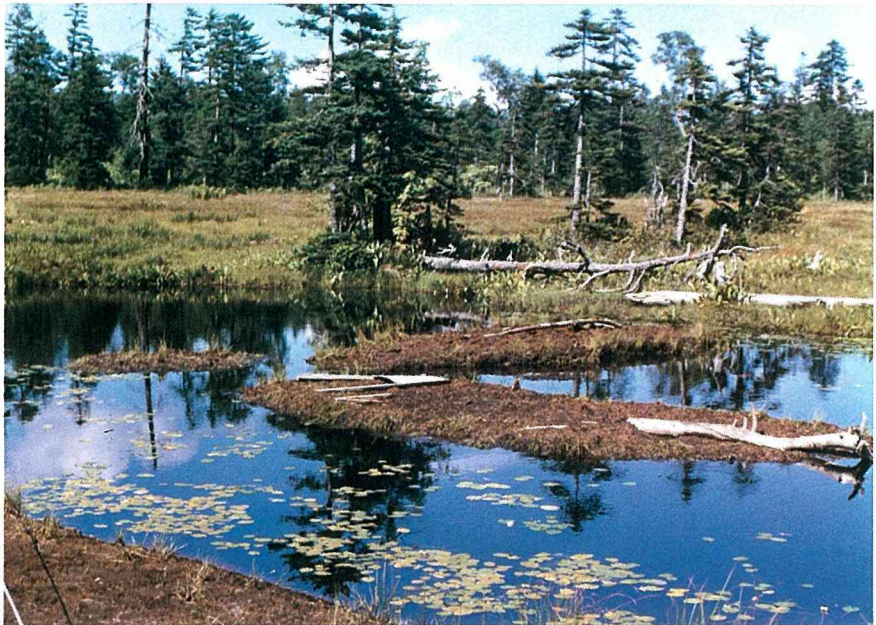
Photo 5. Floating islets on Ohnuma pond, of which vegetation has been completely damaged by the treading. (photo by Ito, 11 Sept. 1985).