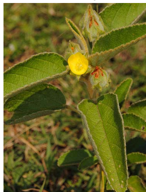
74 Melhania velutina MALVACEAE