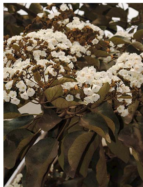
35 Cordia africana BORAGINACEAE