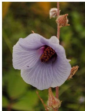
73 Hibiscus cannabinus cf. MALVACEAE