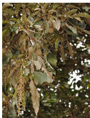
46 Croton megalocarpus EUPHORBIACEAE