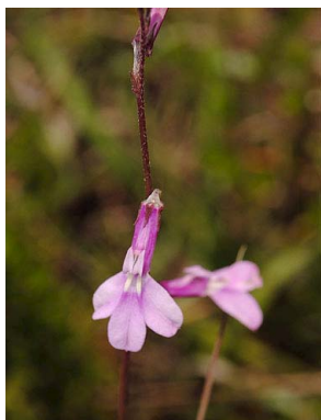
38 Lobelia holstii CAMPANULACEAE