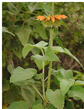
66 Leonotis nepetifolia LAMIACEAE