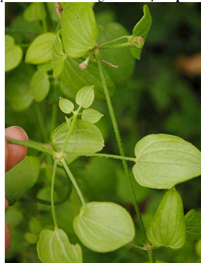
84 Rubia cordifolia RUBIACEAE