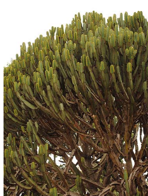
48 Euphorbia candelabrum EUPHORBIACEAE