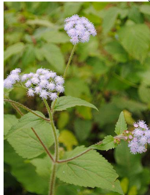
21 Ageratum conyzoides ASTERACEAE

© Environmental & Conservation Programs, The Field Museum, Chicago, IL 60605 USA [rrc@fieldmuseum.org] [http://fieldmuseum.org/IDtools/] Rapid Color Guide # 330 version 1 02/2012