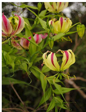
39 Gloriosa superba COLCHICACEAE