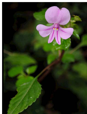
30 Impatiens papilionacea BALSAMINACEAE