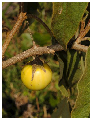
92 Solanum incanum SOLANACEAE