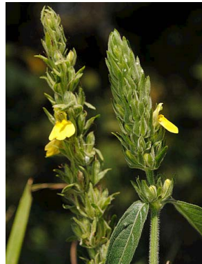
5 Justicia flava ACANTHACEAE