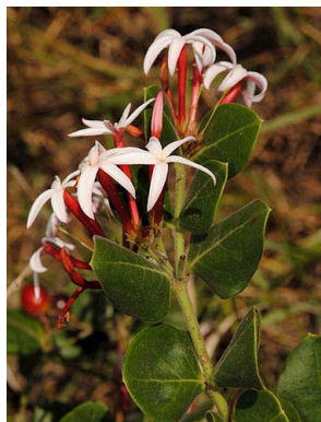
12 Carissa edulis APOCYNACEAE