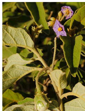
90 Solanum incanum SOLANACEAE