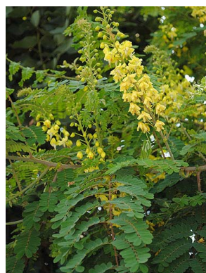
50 Caesalpinia decapetala FABACEAE-CAESALP.