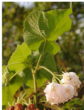
93 Dombeya burgesiae? STERCULIACEAE