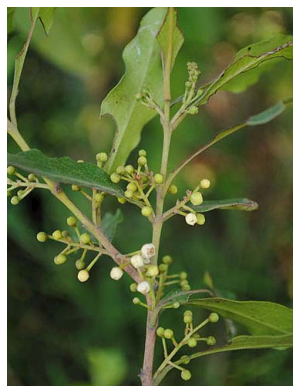
19 Ilex mitis AQUIFOLIACEAE