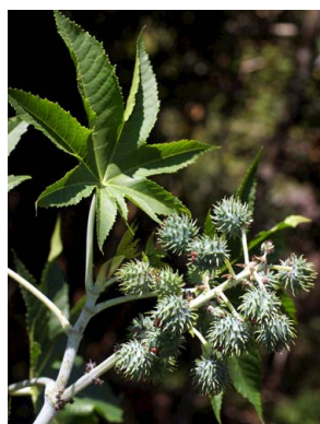
49 Ricinus communis EUPHORBIACEAE