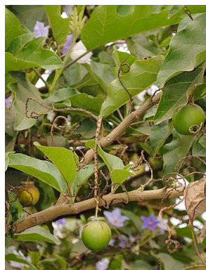
89 Solanum crinitum SOLANACEAE