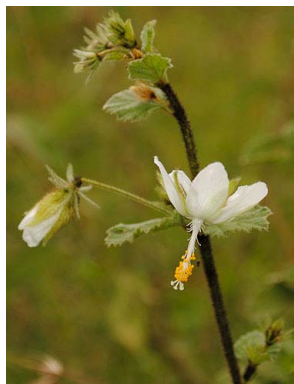
72 Hibiscus flavifolius cf. MALVACEAE