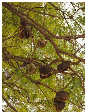
32 Jacaranda mimosifolia BIGNONIACEAE