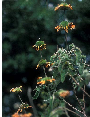
65 Leonotis nepetifolia LAMIACEAE