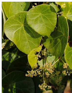
76 Stephania abyssinica MENISPERMACEAE