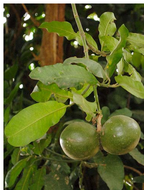
18 Tabernaemontana stapfiana APOCYNACEAE