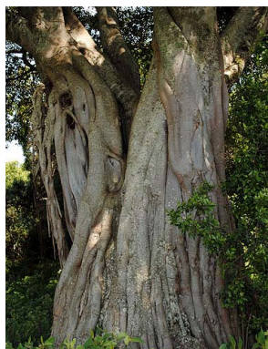
77 Ficus thonningii MORACEAE