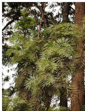
79 Grevillea robusta PROTEACEAE