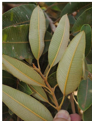
11 Ozoroa insignis ANACARDIACEAE