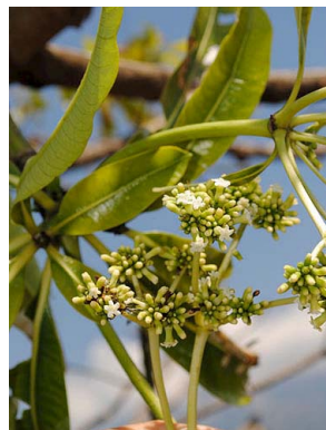
15 Rauvolfia caffra APOCYNACEAE