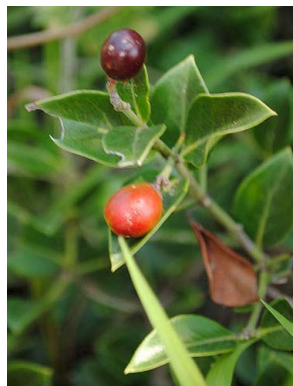
13 Carissa edulis APOCYNACEAE