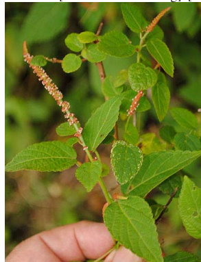
43 Acalypha racemosa EUPHORBIACEAE