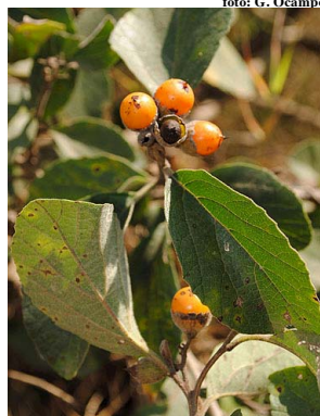
36 Cordia monoica BORAGINACEAE