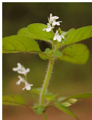
6 Justicia matammensis ACANTHACEAE