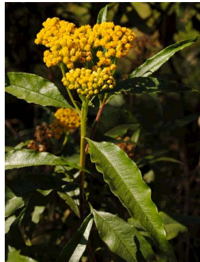
25 Psiadia arabica ASTERACEAE