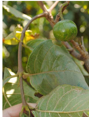
85 Vangueria infausta RUBIACEAE