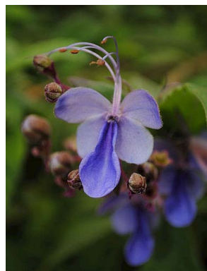
70 Rothea myricoides ( Clerodendrum myricoides ) LAMIACEAE