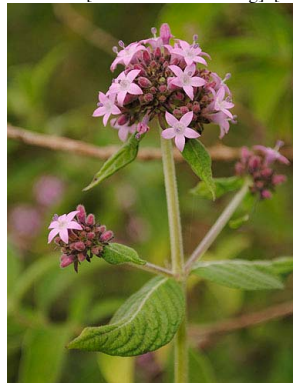
83 Pentas lanceolata RUBIACEAE