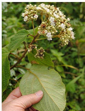
37 Ehretia amoena BORAGINACEAE