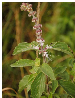
68 Orthosiphon parvifolius LAMIACEAE