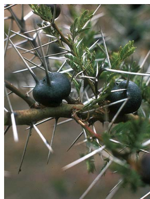
55 Acacia drepanolobium FABACEAE-MIMOS.