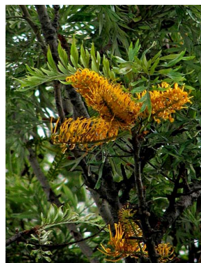
80 Grevillea robusta PROTEACEAE