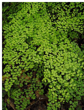
99 Adiantum thalictroides PTERIDOPHYTE