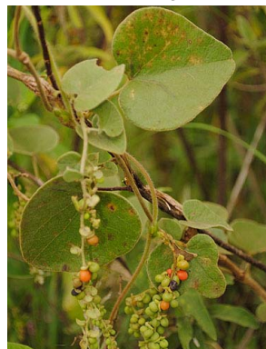
75 Cissampelos mucronata MENISPERMACEAE