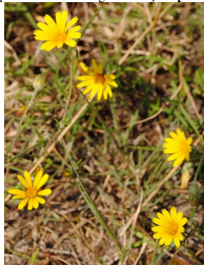
24 Hirpicium diffusum ASTERACEAE