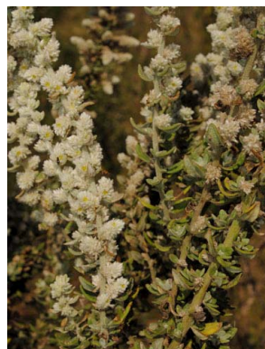
10 Aerva lanata AMARANTHACEAE