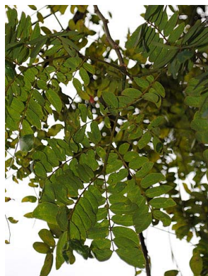
58 Albizia schimperiana FABACEAE-MIMOS.