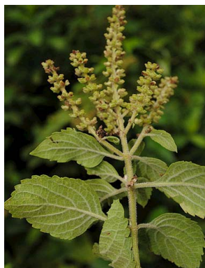
67 Ocimum gratissimum LAMIACEAE