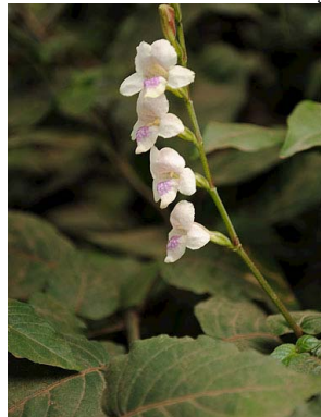
1 Asystasia gangetica ACANTHACEAE

© Environmental & Conservation Programs, The Field Museum, Chicago, IL 60605 USA [rrc@fieldmuseum.org] [http://fieldmuseum.org/IDtools/] Rapid Color Guide # 330 version 1 02/2012