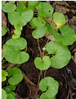
82 Geophila repens RUBIACEAE