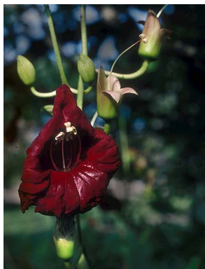
33 Kigelia africana BIGNONIACEAE