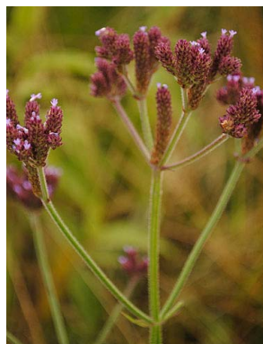
98 Verbena bonariensis VERBENACEAE