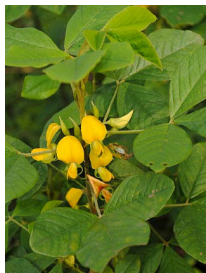
59 Crotalaria FABACEAE-PAPIL.