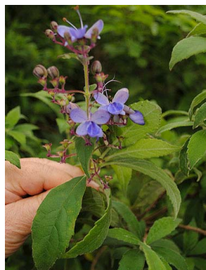
69 Rothea myricoides ( Clerodendrum myricoides ) LAMIACEAE