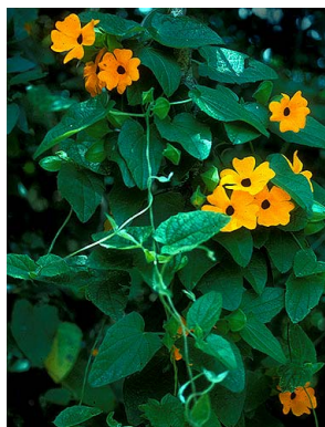
7 Thunbergia alata ACANTHACEAE