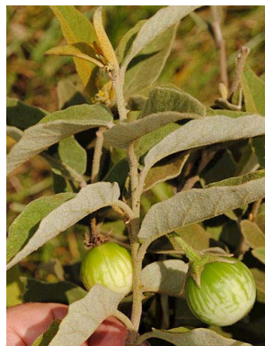
91 Solanum incanum SOLANACEAE