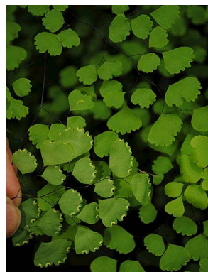
100 Adiantum thalictroides PTERIDOPHYTE