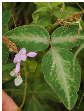
60 Desmodium FABACEAE-PAPIL.