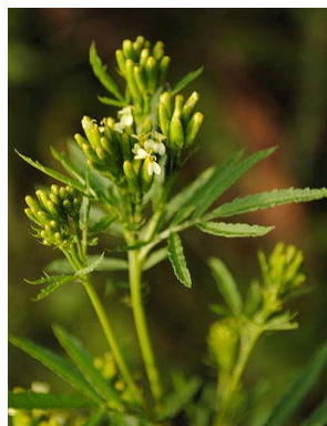
26 Tagetes minuta ASTERACEAE