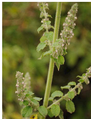
71 Plectranthus LAMIACEAE