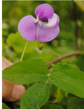
63 Vigna vexillata FABACEAE-PAPIL.