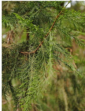
42 Juniperus procera CUPRESSACEAE