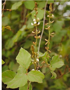
61 Glycine wightii FABACEAE-PAPIL.

Rapid Color Guide # 330 version 1 02/2012