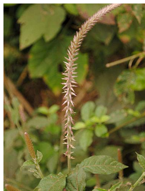
9 Achyranthes aspera AMARANTHACEAE