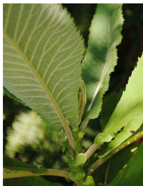
29 Vernonia auriculifera ASTERACEAE