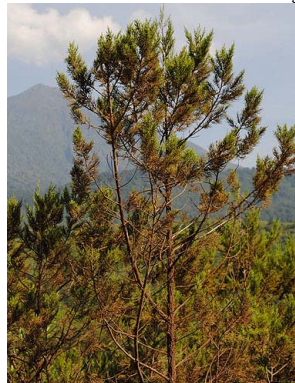
41 Juniperus procera CUPRESSACEAE

Rapid Color Guide # 330 version 1 02/2012