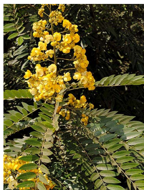
53 Senna spectabilis FABACEAE-CAESALP.