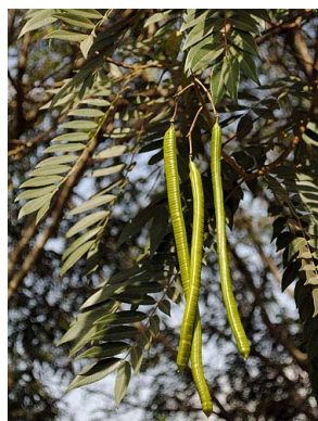
54 Senna spectabilis FABACEAE-CAESALP.