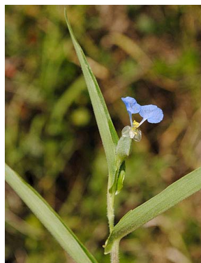
40 Commelina benghalensis COMMELINACEAE