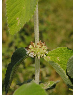
64 Leonotis mollissima LAMIACEAE