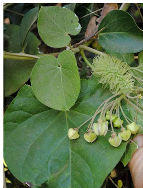
14 Pergularia daemia APOCYNACEAE