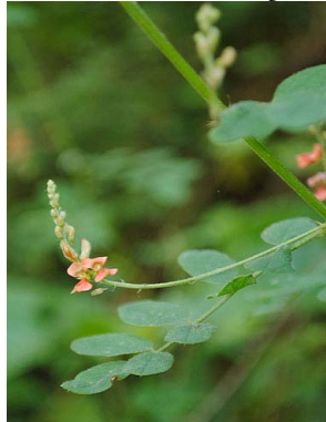
62 Indigophora subcorymbosa? FABACEAE-PAPIL.