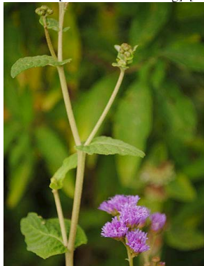
23 Gutenbergia cordifolia ASTERACEAE