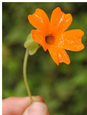
8 Thunbergia alata ACANTHACEAE