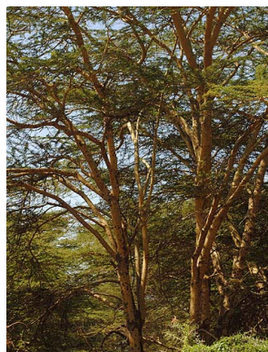
56 Acacia xanthophloea FABACEAE-MIMOS.