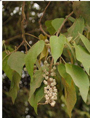
44 Croton macrostachyus EUPHORBIACEAE