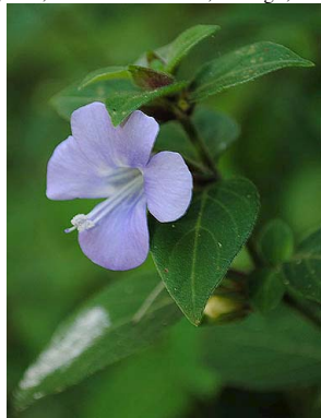
2 Barleria submollis ACANTHACEAE