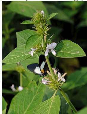
3 Hypoestes aristata ACANTHACEAE