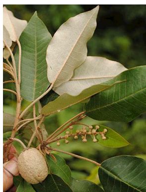
47 Croton megalocarpus EUPHORBIACEAE