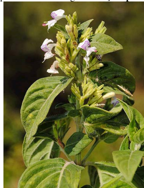
4 Hypoestes verticillaris ACANTHACEAE