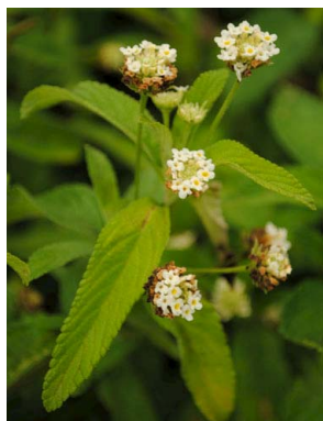
97 Lantana trifolia cf. VERBENACEAE