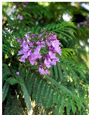
31 Jacaranda mimosifolia BIGNONIACEAE