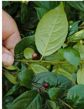
81 Rhamnus prinoides RHAMNACEAE

© Environmental & Conservation Programs, The Field Museum, Chicago, IL 60605 USA [rrc@fieldmuseum.org] [http://fieldmuseum.org/IDtools/] Rapid Color Guide # 330 version 1 02/2012