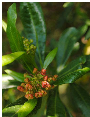
86 Dodonea viscosa SAPINDACEAE