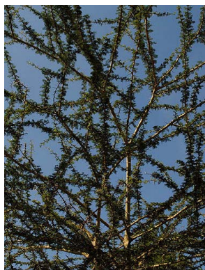
57 Acacia xanthophloea FABACEAE-MIMOS.