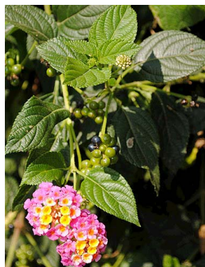
96 Lantana camara VERBENACEAE