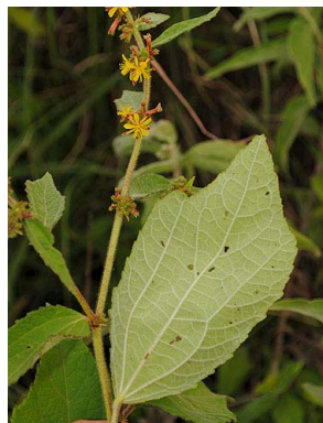
94 Triumfetta rhomboidea TILIACEAE