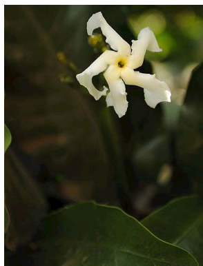
17 Tabernaemontana stapfiana APOCYNACEAE