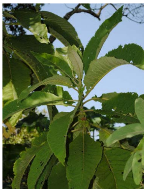
28 Vernonia auriculifera ASTERACEAE