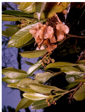
87 Dodonea viscosa SAPINDACEAE