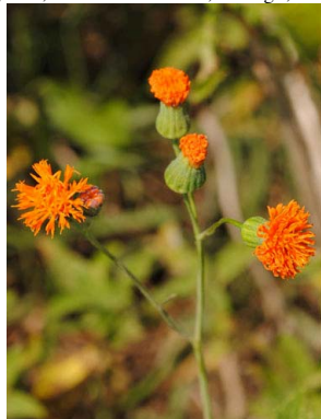
22 Emilia coccinea ASTERACEAE