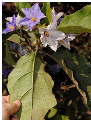
88 Solanum crinitum SOLANACEAE