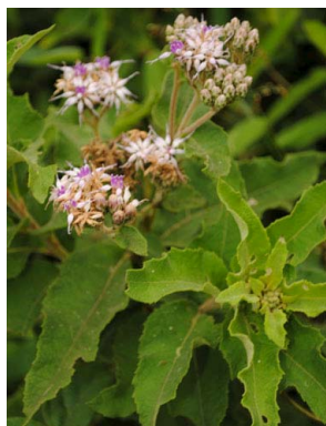
27 Vernonia adoensis ASTERACEAE