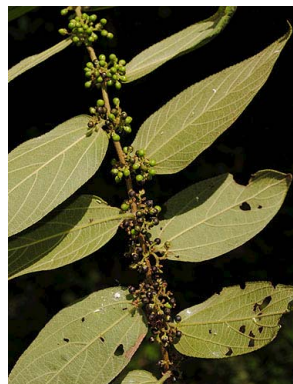
95 Trema orientalis ULMACEAE