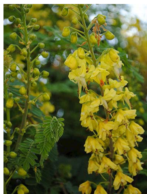
51 Caesalpinia decapetala FABACEAE-CAESALP.