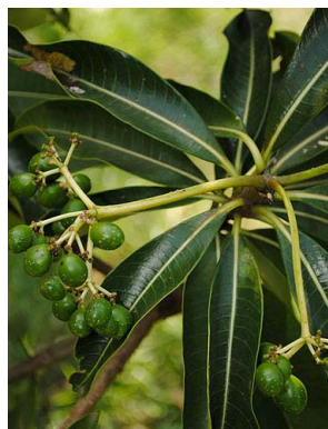
16 Rauvolfia caffra APOCYNACEAE