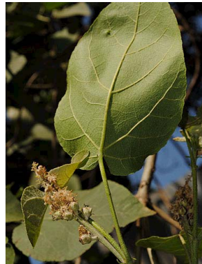
45 Croton macrostachyus EUPHORBIACEAE