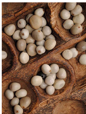
52 Caesalpinia decapetala FABACEAE-CAESALP.