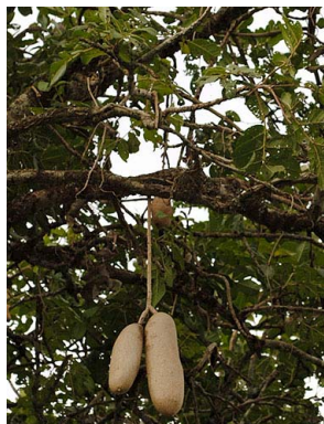
34 Kigelia africana BIGNONIACEAE