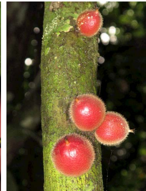
9 Diospyros fragrans