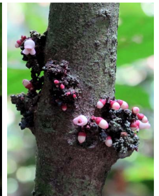
20 Diospyros sp. nov.