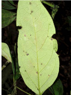
3 Diospyros cinnabarina