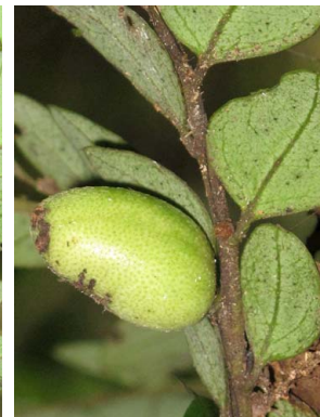
14 Diospyros obliquifolia