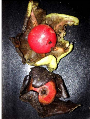
1 Diospyros boala