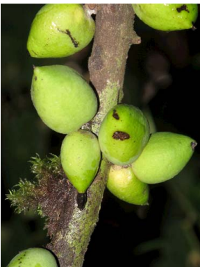
12 Diospyros hoyleana