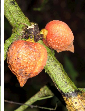
4 Diospyros cinnabarina