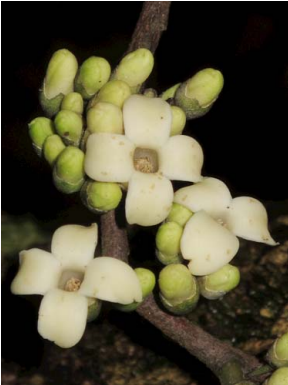
2 Diospyros boala