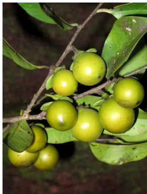
16 Diospyros piscatoria