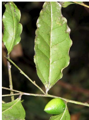
18 Diospyros vermoesenii