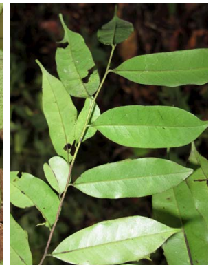
15 Diospyros piscatoria