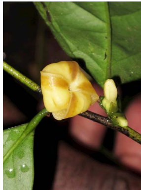
8 Diospyros deltoidea