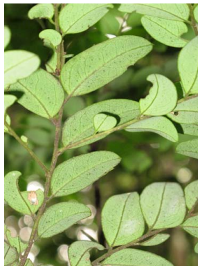
13 Diospyros obliquifolia