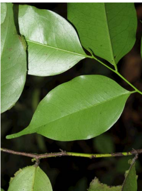
17 Diospyros rabiensis