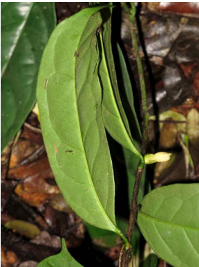
7 Diospyros deltoidea