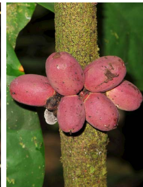
19 Diospyros sp. nov.