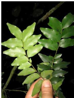
11 Diospyros hoyleana