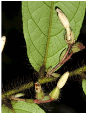
6 Diospyros conocarpa