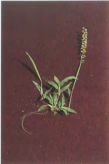
Small burr grass