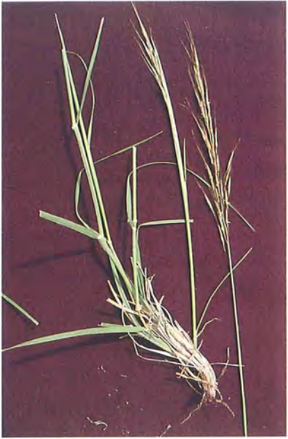
Golden beard grass