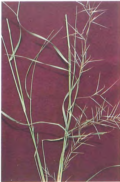
Wire grass (Aristida)