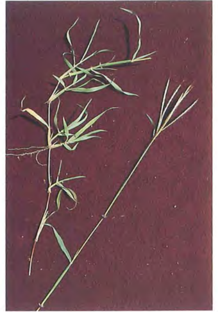
Pertusa or Indian couch