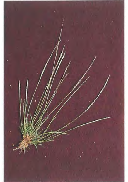
Five minute grass