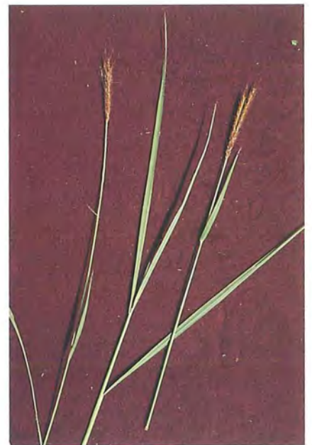
Silky brown top