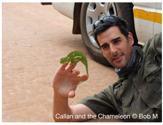
Day 7 - 30 April, Lekgalameetse, Day 3.

This time, on the way in, Callan spotted a Flapnecked Chameleon crossing the road. This gave some great photo opportunities – they tolerate handling well, don't bite, and move very slowly. Many of them get squashed on the roads so relocating it in the bushes was an act of kindness.