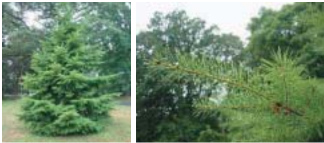
Pseudotsuga menziesii (both photos)

Largely confined to streambanks, rivers and lakeshores, this species can reach 100', but is typically smaller. Its oval leaves are glossy dark green. Black cottonwood grows quite quickly and spreads by suckers. Native from AK to Baja CA on both sides of the Cascades, and to southwest Alberta, western MT, WY and UT.