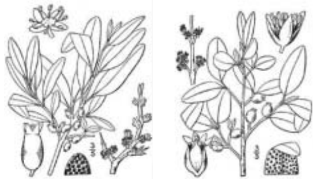
Shepherdia argentea (left), Shepherdia canadensis (right)

This shrub or multi-stemmed small tree reaches 10-15 feet tall by 6-10' wide, providing a fairly dense form of silver foliage. The apetalous male and female flowers are on separate plants (dioecious), and appear prior to the leaves in early spring. Long narrow leaves are entire and covered in silver scales on both sides. Branches are opposite and may be spine-tipped. The edible reddish-yellow fruits and dense thorny growth form provide excellent bird habitat. Typical along water courses from British Columbia to southern CA on the east side of the Cascades, east to MN, and in MT east of the Rocky Mountains, but not known from WY or ID.