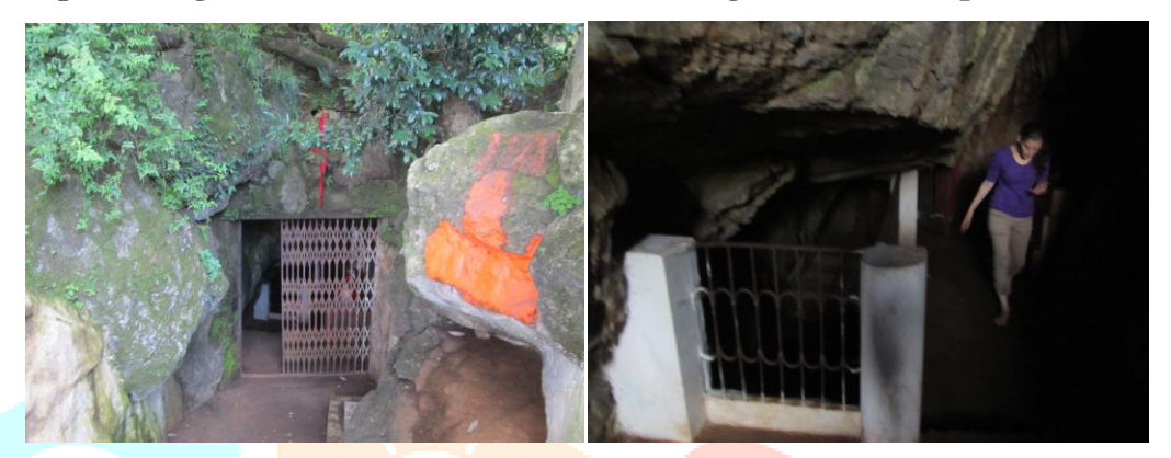
Fig.: 3. Pandava Cave entrance