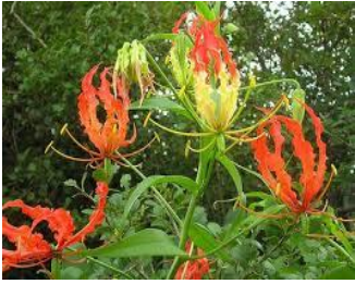
Fig 3: Ariel part of Gloriosa superb