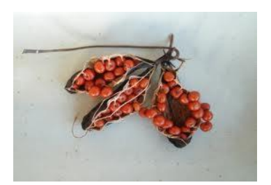
Fig 6: Matured pod with seeds