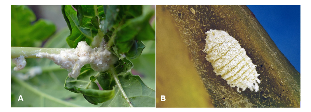
Figure 1: Paracoccus marginatus : (A) colony on Papaya carica, British Virgin Islands; (B) close-up of adult female (body length about 2.2 mm) intercepted in UK on Hibiscus sabdariffa imported from Gambia