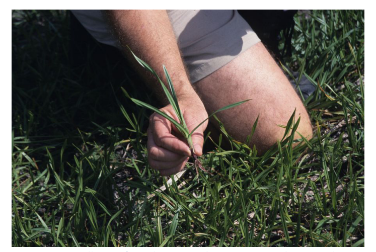
Figure 20. Seedlings of Wright's nutrush regenerate in bare patches among fallen debris from the past season's plants at a dried marsh pond in Lee County (photographed April 2002).

over green is immediately recognizable to people who spot Wright's nutrush from an airboat, helicopter, or plane.