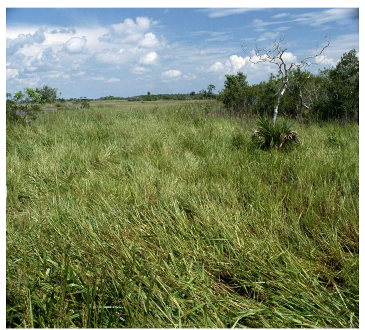
Figure 2. The first observance of large acreages of Wright's nutrush in Upper Basin marshes of the St. Johns River (photographed Sept. 2001).