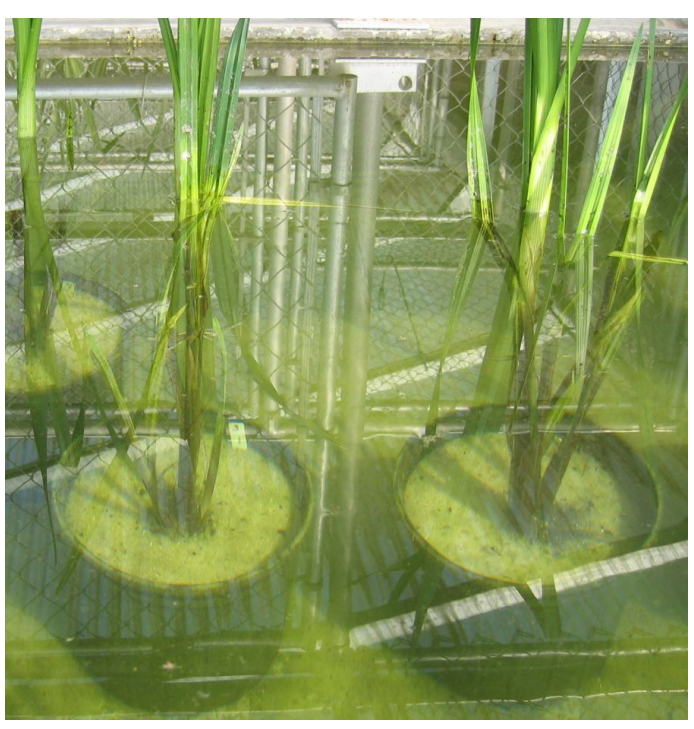
Figure 6. Early inundations of deep surface water suppress basal meristems in Wright's nutrush to result in tall plants consisting of only a few stems.

Conditions associated with spring dry down are normal for Florida wetlands. In fact, intact seasonality of a hydroperiod is highly desirable for the ecosystem services it provides. A goal for many resources managers is the attainment of dry down in spring. The introduction of Wright's nutrush and the continual buildup of its seed bank in wetland substrates