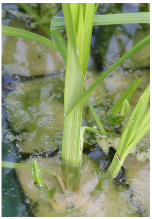
Figure 12. The strongly three-sided stems of Wright's nutrush are typical for a sedge species. The width of each side, however, is exceptionally broad [up to 2.5 cm (1.5 in) across], which makes for an extremely robust plant that is tolerant of wet as well as dry conditions during the summertime growth period.

While all native nutrush species have a tendency to grow in wetlands, two species ( S. reticularis and S. verticillata ) have stronger affinities to wetter habitats and could be seen near locales hosting Wright's nutrush. Yet, neither has been found associating closely with Wright's nutrush, meaning they have not been found in the same habitat during the same time as Wright's nutrush. Like Wright's nutrush, S. reticularis and S. verticillata are annuals in growth habit; they establish from seed and grow quickly to produce a few upright stems. Their similarities with Wright's nutrush