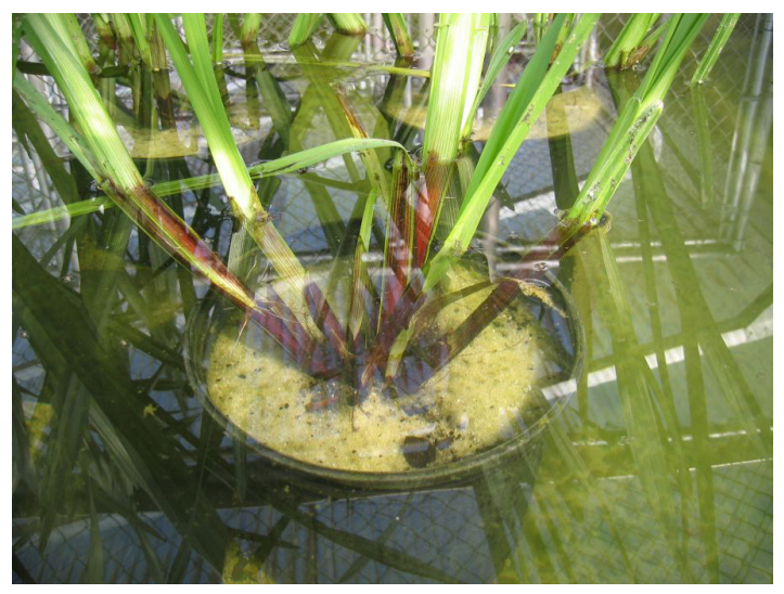
Figure 13. Streaks of dark red tinge the base of stems and extend through the roots of Wright's nutrush (photo by Leo Nico, USGS).

Individual plants of Wright's nutrush typically have one to five lead stems that grow from 75 to 200 cm (29 to 79 in) tall. Stems are strongly three-sided and heftier in girth than other grass-like species occurring in Florida marshes