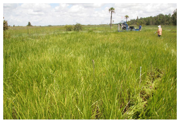
Figure 8. An untreated control plot remains densely populated with Wright's nutrush at Blue Cypress Water Management Area, Upper Basin, St. Johns River (photographed July 9, 2009).