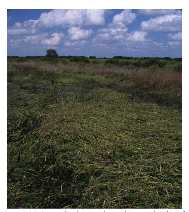
Figure 3. Wright's nutrush colonizing the southeastern shoreline of Lake Kissimmee, just north of Hwy 60 along the edge of a wet grazing area with cattle (photographed Sept. 2002).