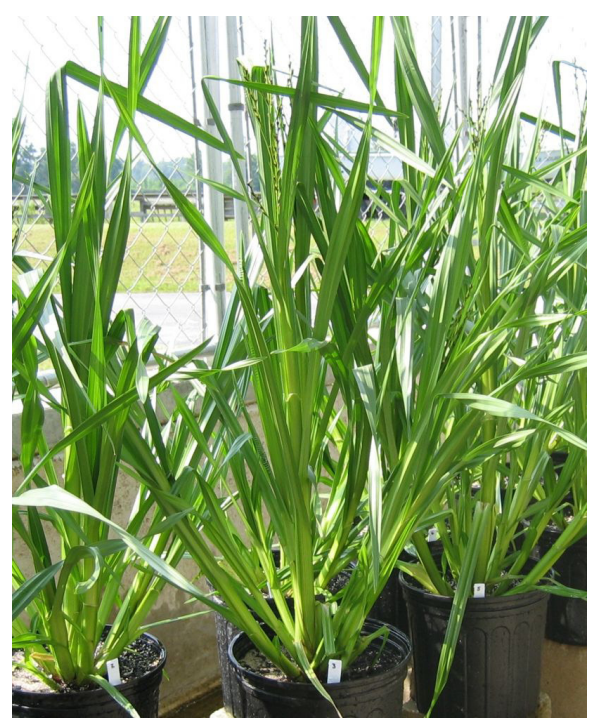
Figure 7. Continuously dry and very shallow surface water make for a complex architecture in Wright's nutrush, which is free to produce multiple stems and overall shorter plants.

prone to seasonal wet/dry fluctuations present a new invasive plant management challenge.