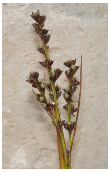
Figure 18. Mature seeds of Wright's nutrush remain nested in rust-colored scales.

petals or sepals, the flowers are often overlooked when they appear (July through August). Within weeks, however, they become more noticeable as they fill. As the seeds mature (September to October), the plants have already begun to senesce, turning a straw yellow-green from the fresh bright-green of summer. Meanwhile, the seed stalks darken, which paints a rusty hue across the tops of standing populations (Figure 17). This characteristic color scheme of rust