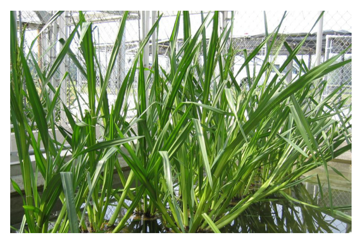
Figure 14. The leaves of Wright's nutrush are long, wide, and lance-shaped. Their "W"-like pleats and blunt tips are clearly displayed. The plants pictured are entering the flowering stage at which time their leaves tend to bend toward the tip in a manner that reflects sunlight.

(Figure 12). Each angled side measures 1.5 to 2.5 cm (0.59 to 1 in) across. The lower stems fill with spongy aerenchyma tissue to promote oxygen exchange and buoyancy as surface water rises in summer. When lower stems become flooded or upper stems fall across deep surface waters, small fibrous roots develop at the nodes. Vertical streaks of dark red run down the stem base and through the roots (Figure 13). Individual plants do not spread or produce runners and are easily pulled from the substrate.