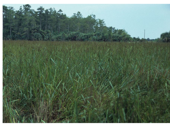
Figure 17. Yellowing stems topped by rusty seed stalks confer a characteristic color scheme across maturing populations of Wright's nutrush (photographed Sept. 18, 2006, marsh pond at Florida Fish and Wildlife Conservation Commission office, Vero Beach).

Flowers are produced on rigid stalks that emerge from the top of stems (Figure 15). These stalks can grow to 30 cm (11.8 in) before they mature (Figure 16). Lacking showy