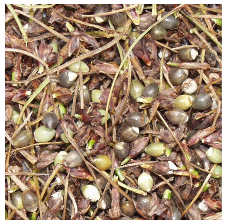
Figure 19. Fresh seeds of Wright's nutrush collected in October changed from jade to olive-green, grey, and white soon after picking.