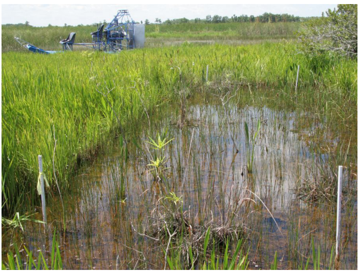
Figure 10. The benefits of early treatment (May 12) of Wright's nutrush are demonstrated by the resulting open water and appearance of native plants within the plot (photographed July 9, 2009 at Blue Cypress Water Management Area, Upper Basin, St. Johns River). A potential disadvantage of early treatment is that ATVs must be available to access the marsh, which often remains dry into May. Plants were just past ankle height (25 cm, 10 in) at the time of treatment.

In areas where water management is possible, a delay in the implementation of draw down in spring will result in a similar delay of seedling emergence. Because plants