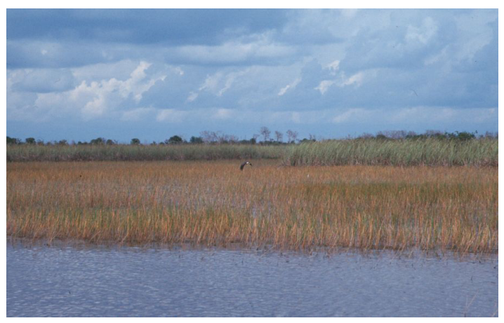
Figure 5. In the Upper St. Johns and Kissimmee Basin marshes, Wright's nutrush is encroaching on critical habitats of the Florida snail kite ( Rostramus sociabilis ).

season. Wright's nutrush will not persist over winter nor will it re-grow from basal parts. Its inability to persist is unlike the dominant native species in the wetlands affected. Like other annual species, however, Wright's nutrush produces large amounts of seed that overwinter in the wetland as a source for future populations.