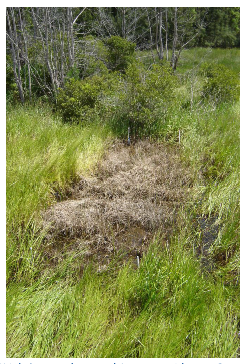
Figure 9. Wright's nutrush treated August 5 with 0.5% Reward at Blue Cypress Water Management Area, Upper Basin, St. Johns River (photographed Sept. 17, 2009). At the time of treatment, plants emerged from 12 cm (5 in) of surface water and although large, 90 cm (35 in) were not yet flowering. The photo demonstrates the disadvantages of a late treatment, which involved a heavy biomass production that was slow to decay and the sequestration of native plant growth for an entire growing season. Preliminary trials indicate that a further 10% reduction in dosage (to 0.05% Reward) may be as effective.