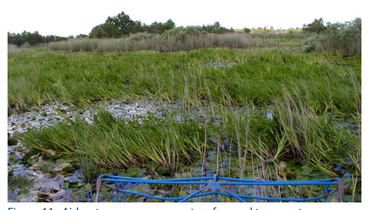
Figure 11. Airboats are common vectors for seed transport across drainage basins (photographed Aug. 16, 2002 at Blue Cypress Water Management Area, Upper Basin, St. Johns River by Ken Snyder).

that emerge weeks to months later than normal have been shown to lag significantly behind in size and in ultimate seed production, draw down delays may be useful as part of a long-term management program.