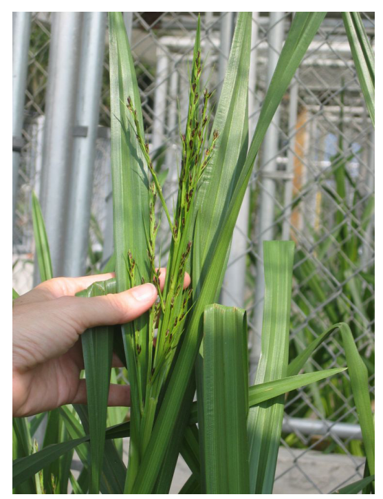
Figure 15. Stalks (inflorescences) bearing inconspicuous flowers begin to emerge from the top of a lead stem of Wright's nutrush (photo by Leo Nico, USGS).