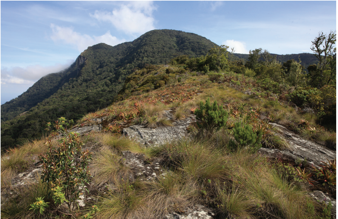
FIGURE 3. Habitat of Polystachya nguruensis . This lithophytic herb grows on gently to more steeply inclined, but not vertical, bare rock sections at around 2100 m. Such larger crystalline rock slabs, some several hectares in size, are typical of many parts of the Ngurus and other Eastern Arc Mountains.

HABITAT: This lithophytic herb grows on gently to more steeply inclined, but not vertical bare rock sections at