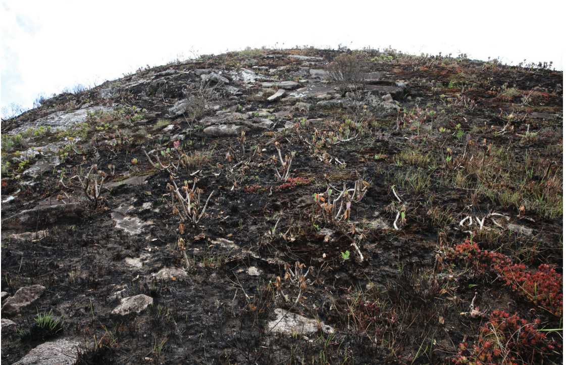
FIGURE 4. The largest site of Polystachya nguruensis , also the type locality, was destroyed completely by a large fire in October/November 2022. When revisiting the site in December 2022, all specimens of the orchid were dead.

around 2100 m (Fig. 3). Such larger crystalline rock slabs, some several hectares in size, are typical of many parts of the Ngurus and other Eastern Arc Mountains. They are obviously, at least in part, naturally old forest-free sites as a result of poorly weathering rock with inhibited soil formation. Another factor for the absence of forest seems to be natural fires, which have increased greatly in recent times due to human disturbance.