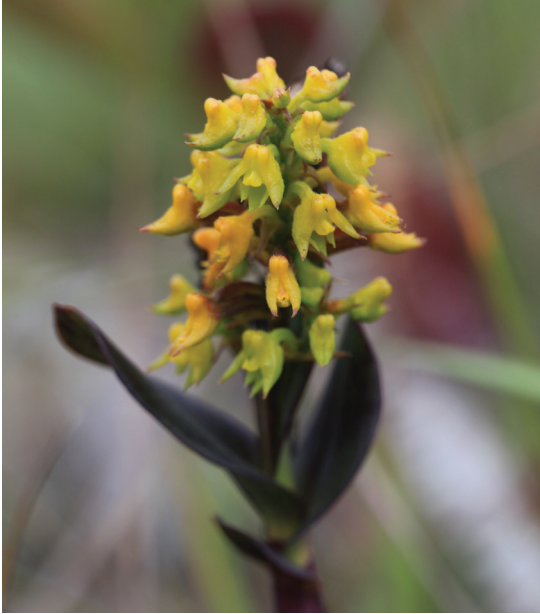
FIGURE 2. Polystachya nguruensis inflorescence in situ in the Nguru Mountains.

ETYMOLOGY: The species epithet “ nguruensis ” denotes that this species is, so far as is known, endemic to the Nguru Mountains of Tanzania.