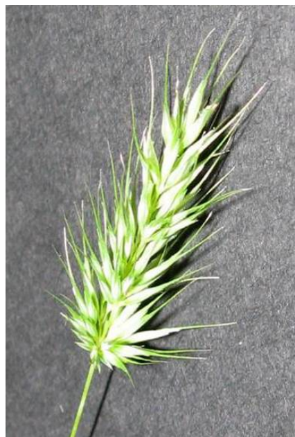
Poaceae Eleusine indica Crowsfoot Grass