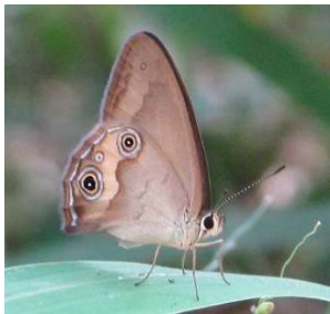
Brown Ringlet butterfly

Caterpillar food plant for: Brown Ringlet Orange-streaked Ringlet White-brand Grass-skipper