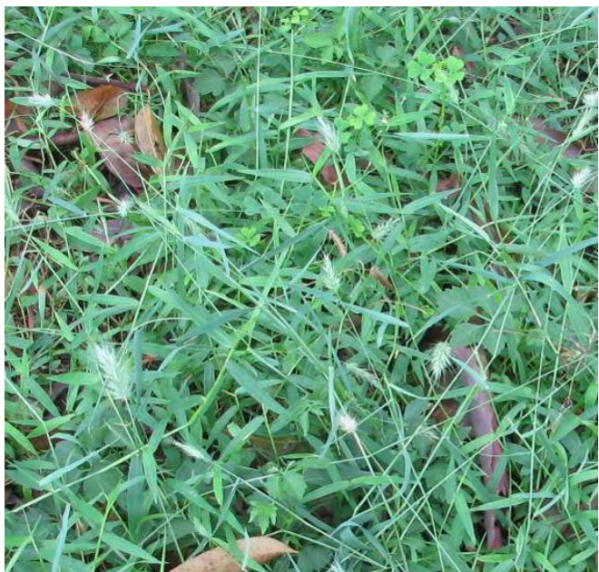
Poaceae Echinopogon ovatus Forest Hedgehog Grass