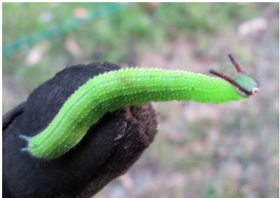
Evening Brown Caterpillar

Caterpillar food plant for: Orange-streaked Ringlet Evening Brown