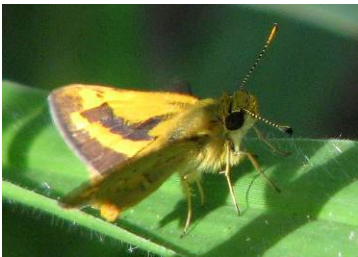
Greenish Grass-dart butterfly

Caterpillar food plant for: Evening Brown Greenish Grass-dart