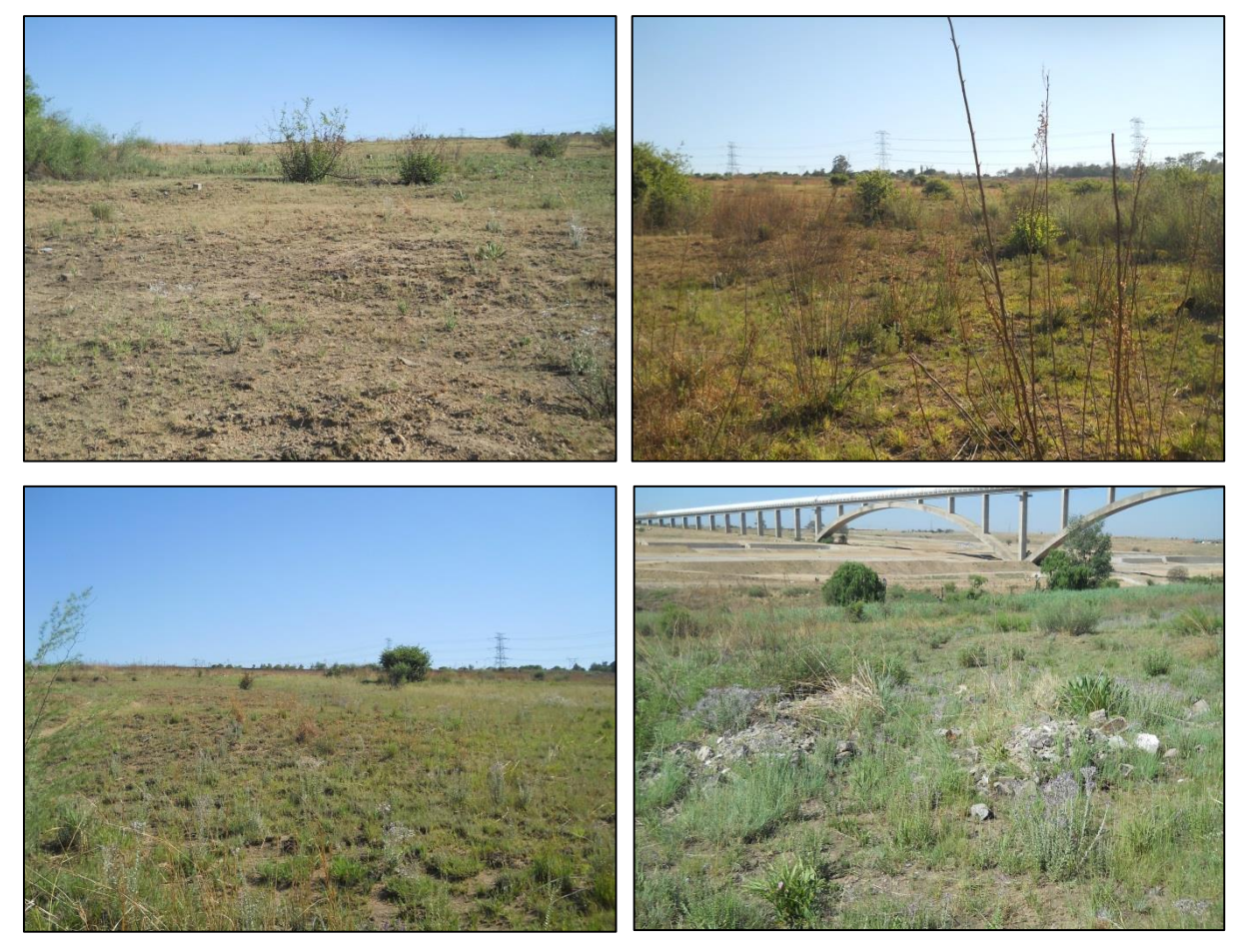
Figure 2: The Impacted Grassland Habitat Unit which is representative of the majority of the study area.

The forb layer is relatively diverse and is dominated by Eriosema burkei and Vernonia oligocephala . Other species present include Delosperma herbeum , Ledebouria revoluta , Conyza podocephala , Acalypha angustata and Cyanotis speciosa .