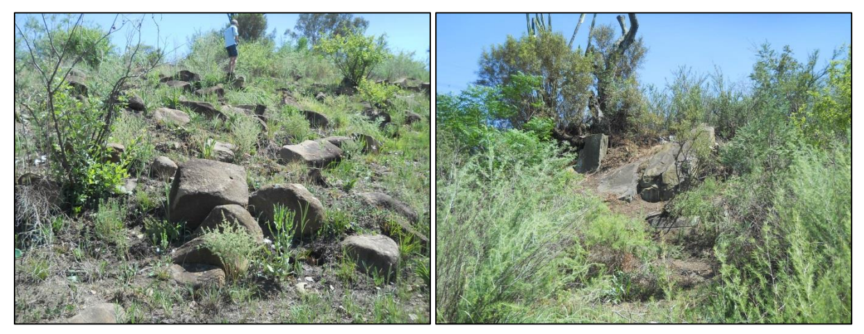
Figure 3: The Rocky Ridge Habitat Unit within the eastern portion of the study area.

Although the study area slopes downward from the north of the study area to the south, no typical characteristics of ridges were observed within the study area, apart from the habitat associated with the Rocky Ridge Habitat Unit. This habitat unit provides varied topography, refuge and niche habitat for faunal and floral species, while the remainder of the study area is relatively homogeneous in nature, with the exception of wetland areas.