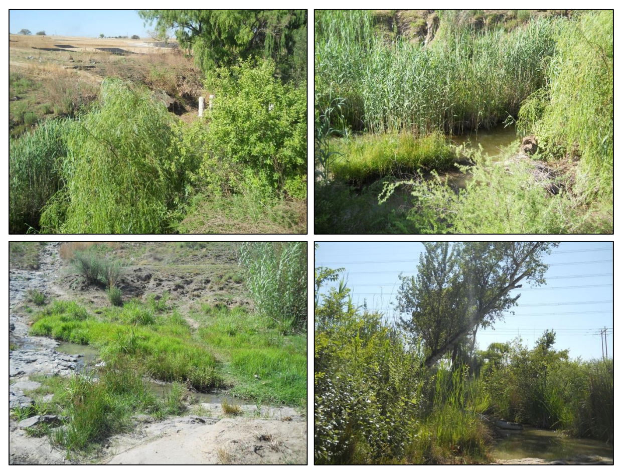
Figure 4: The Wetland Habitat Unit present in the study area.

The dominant floral species encountered within the Wetland Habitat Unit are listed in Table 3 below.