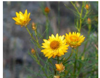
Xerochrysum viscosum JG