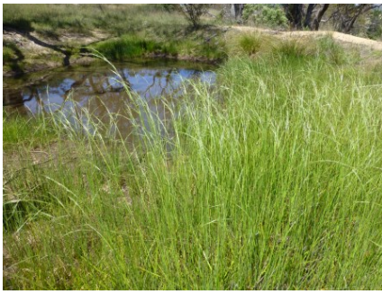
Amphibromus nervosus RF