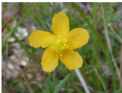
Hypericum gramineum RF