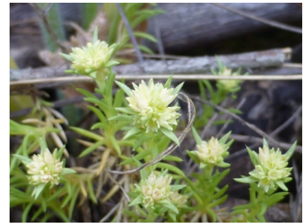
Scleranthus diander RF