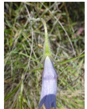
Wahlenbergia stricta RF