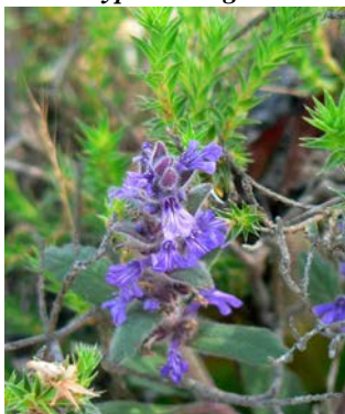
Ajuga australis JG