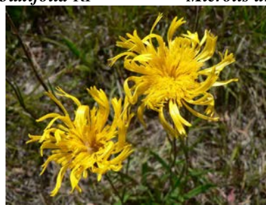
Podolepis jaceoides JG