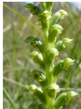
Microtis unifolia RF