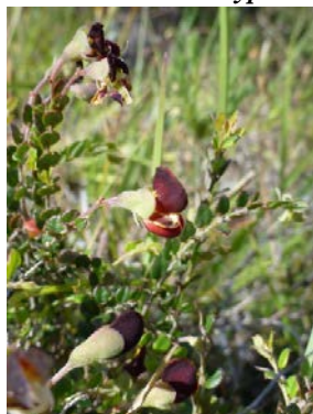
Bossiaea buxifolia RF