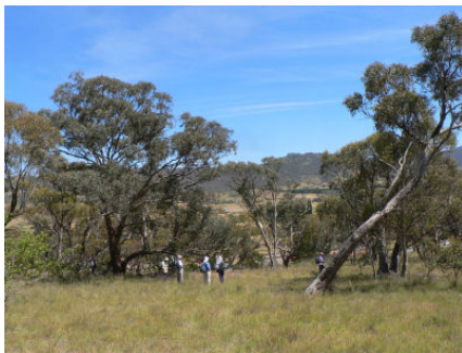
Burra School Reserve

For photos below: = Jean Geue; RF = Roger Farrow