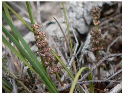
Lomandra multiflora (female) JG