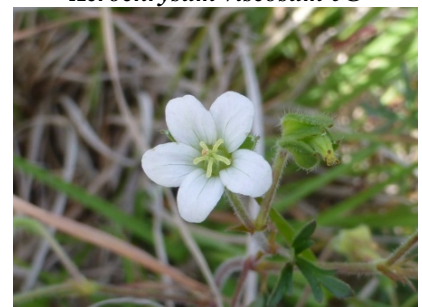
Geranium solanderi RF