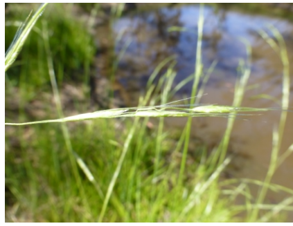
Amphibromus nervosus RF