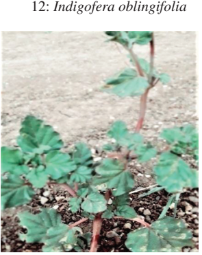
15: Boerhavia erecta