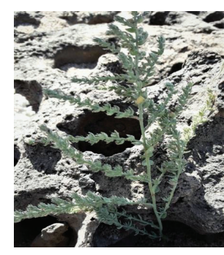
1: Cressa cretica

H = herb, S = shrub, T = tree and G = grass and C = Climber