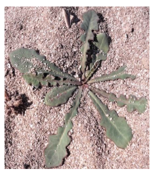
7: Taraxacum mongolicum