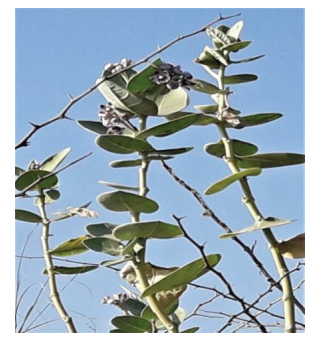
8: Calotropis procera