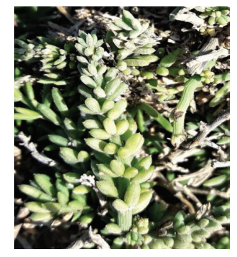
2: Suaeda fruticosa