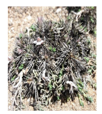
16: Amberboa ramose