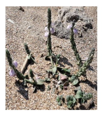
10: Justicia diffusa