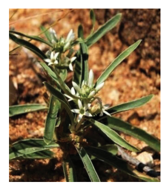
24: Enicostem axillare