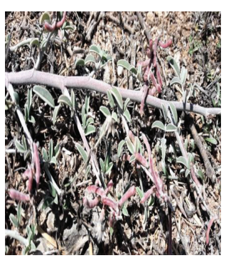
12: Indigofera oblingifolia