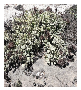
19: Limonium stocksii