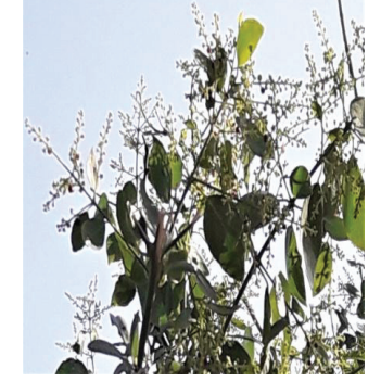
5: Salvadora persica