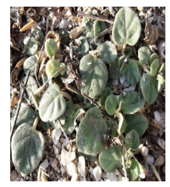
11: Trianthema portulacastrum