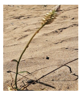
23: Celosia argentea