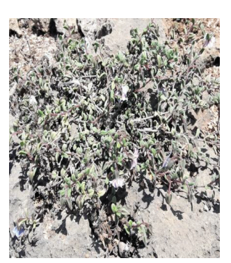
22: Trichodesma indicum