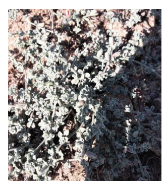
3: Sericostoma pauciflorum