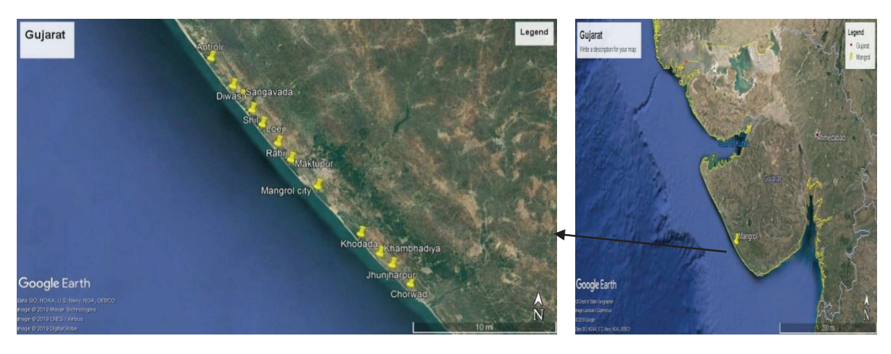
Fig. 1: Map showing study area.

As shown in Table 2, the Fabaceae family is found to be most dominant than all other families. There are three types of plants found in the Fabaceae family, namely Lotus garcini , Prosopis juliflora and Indigofera oblingifolia . Two species are found in Convolvulaceae, Poaceae, Acanthaceae and Amaranthaceae family and in addition to this, 1 plant is found in all family found here.