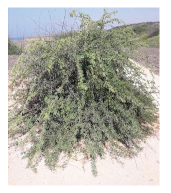
17: Prosopis juliflora PLATE 2