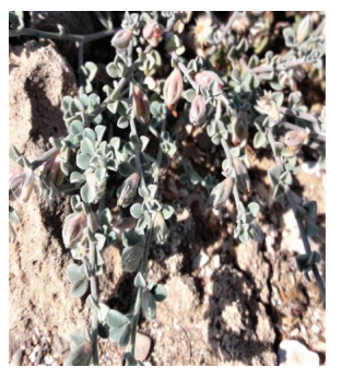
9: Lotus garcini