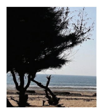
13: Casuarinas equisitifoliys