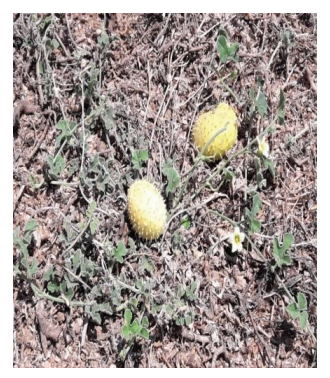
18: Cucumis prophetarum