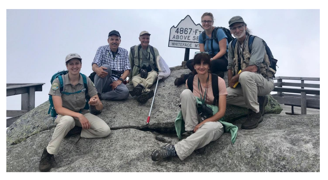
The group at the summit.

Our August 4<sup>th</sup> trip started out in the clouds but as the day progressed the clouds lifted and we were afforded some spectacular views of the Whiteface area. Six of us headed up the stairs to the summit and examined the alpine species along the way, explaining to curious tourists why we were hanging over the railing looking at plants. We then headed down the hiking path to the road and ended our trip just before thunderstorms arrived. Our annual trip always seems to turn up new species for the mountain and this day was exceptional as the group found 13 new species for the summit, some exotic and brought in with the recent road work, and some native like Indian pipe ( Monotropa uniflora ), and twinflower ( Linnaea borealis ssp. longiflora ).