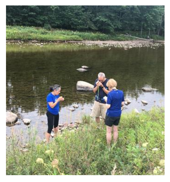
Examining some of the graminoids along the Ausable.

Four intrepid riders met at Upper Jay for a ride along Route 9N to the Village of Jay. We started out spending time off our bikes on the shoreline of the Ausable River in Upper Jay, where we found a large number of species and where we also spent time keying out some of the graminoids. A few showers came through early, but the rest of the trip was rain free and partly sunny. We ended up at the beautiful waterfalls at Jay, where we discovered some species that were new to us, like Canada hawkweed, Hieracium kalmii . The ride was a great way to cover a lot of ground in a day and see a good number of interesting sites. See the next page for a list of the species we saw.