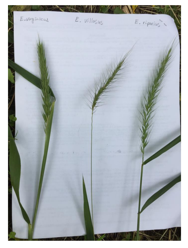
Elymus species diversity at Buttermilk Falls State Park – Larch Meadow Trail.

many species identified there were non-native, naturalized, or invasive species (ex. Schedonorus arundinaceus - tall rye grass, and Dactylis glomerata - orchard grass). However, we did identify a native bluegrass (Poa palustris - fowl bluegrass) in this habitat. The successional and mature hardwood forests at this site contained a number of charismatic native grasses such as Elymus hystrix (bottlebrush grass), E. villosus (downy wild rye), Muhlenbergia sobolifera (rock muhly), and M. schreberi (nimble Will).