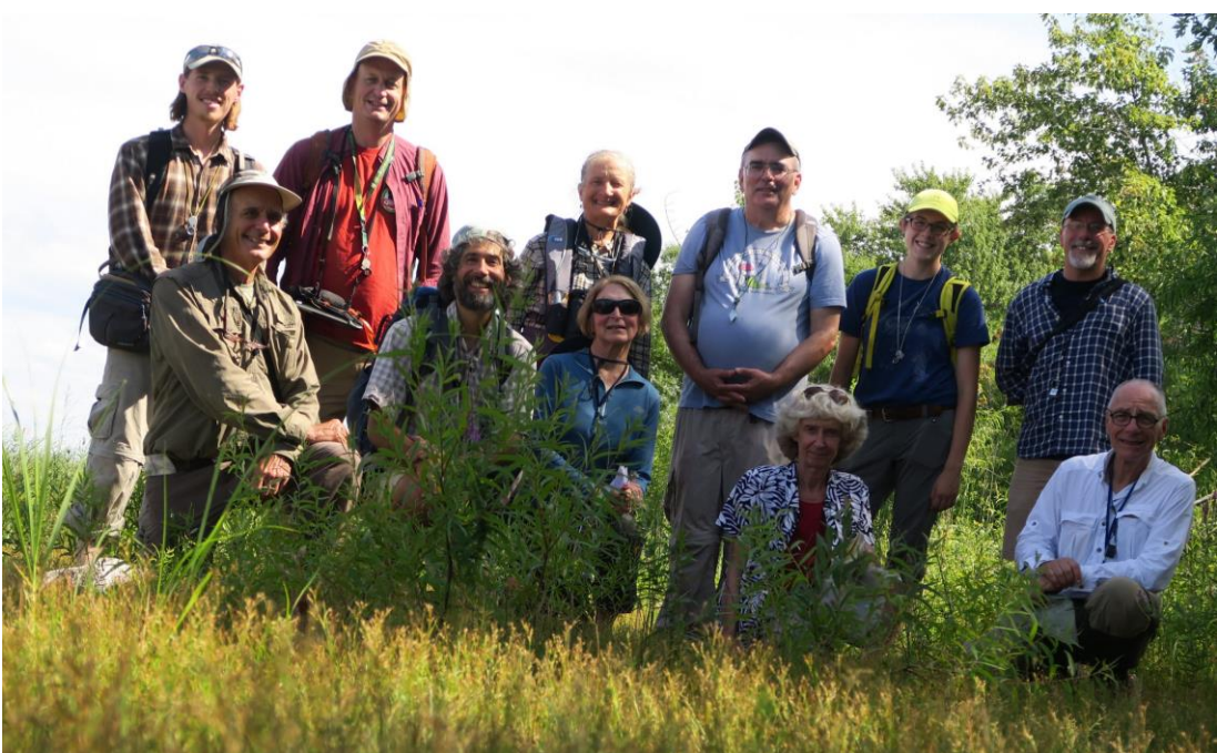
The group posing at the end of the trip.