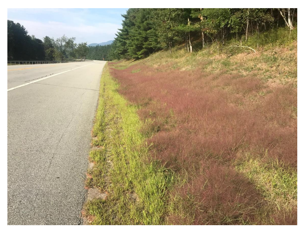
Purple love grass, Eragrostis spectabilis , put on a show along the mowed shoulder of Route 9N.