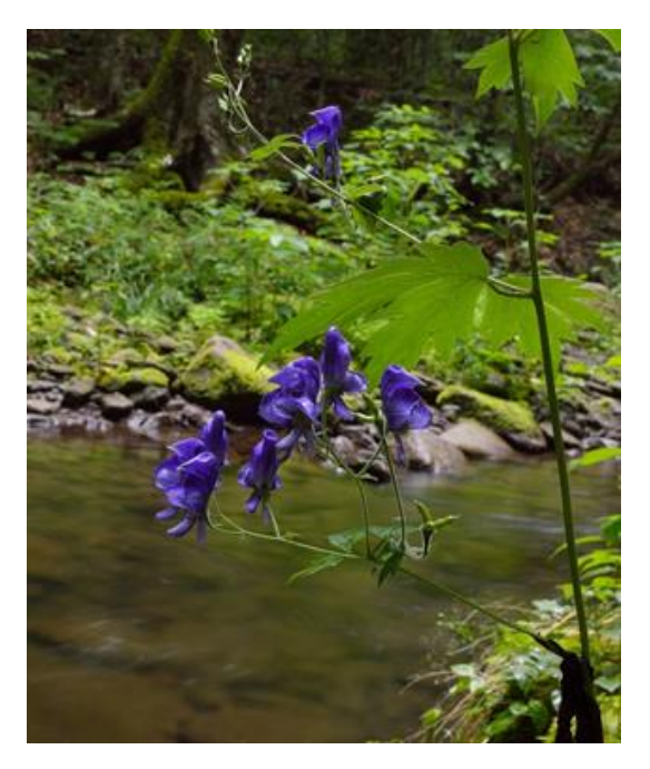
New York Monkshood, Aconitum noveboracense.

I think my next challenge would be to see all the New York named plants in one season except for New York hawthorn, which was last seen in the 19-teens in the Adirondacks.