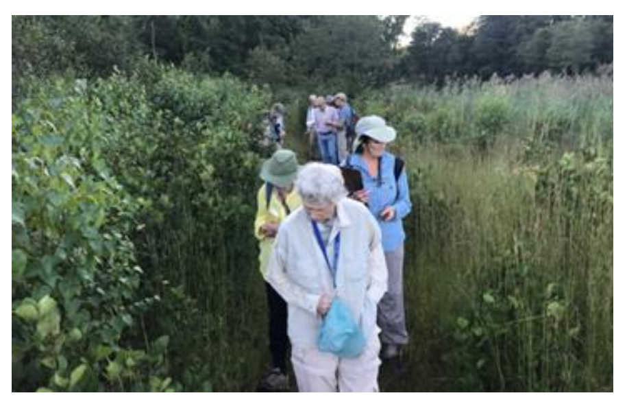
The group wending its way through the wetland.

Alnus incana ssp. rugosa - Spotted Alder Asclepias incarnata ssp. incarnata - Western Swamp Milkweed Cyperus bipartitus - Shining Flat Sedge Cyperus strigosus - False Yellow Nut Sedge Equisetum variegatum - Variegated Scouring Rush Euthamia graminifolia - Common Flat-topped Goldenrod Fuirena autumnalis - Autumn Fimbry Juncus dudleyi - Dudley's Rush Juncus effusus var. solutus - Common Soft Rush Lycopus uniflorus - Northern Bugleweed Lysimachia ciliata - Fringed Loosestrife Lythrum salicaria -Purple Loosestrife Onoclea sensibilis - Sensitive Fern Osmunda regalis - Royal Fern Persicaria punctata - Spotted Smartweed Persicaria sagittata- Arrow-leaved Tearthumb Phragmites australis - European Phragmites Schoenoplectus tabernaemontani - Soft-Stemmed Bulrush Scirpus atrovirens - Dark Green Bulrush Scirpus cyperinus - Common Wool Grass Spiranthes cernua - Nodding Ladies' Tresses Thelypteris palustris - Marsh Fern Xanthium strumarium var. canadense - Canada Cocklebur