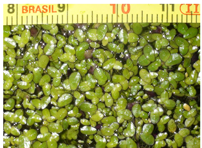
Figure 1. Cultivated specimens of Landoltia punctata .

In recent years a growing economic and technological interest has been developing on the duckweeds, particularly on Landoltia punctata , because of its applications in bioremediation (Cheng et al. 2002; Pott and Pott 2002; Xu and Shen 2011; Mohedano et al. 2012; Miranda et al. 2014), protein production for animal feeding (Chantiratikul et al. 2010; Mohedano et al. 2012) and also biofuel production (Xu et al. 2011; Chen et al. 2012; Ge et al. 2012; Miranda et al. 2014). Furthermore, duckweeds have a very rapid growth, and accumulate biomass at much higher rates than most other plants including crops (Cheng et al. 2002; Xu and Shen 2011; Ge et al. 2012; Miranda et al. 2014). As consequence of cultivation, the distribution of some duckweed species might be expanding. Also, due to their high growth rate, duckweeds could be considered as weedy plants and might cause ecological imbalances (Pott and Pott 2002).