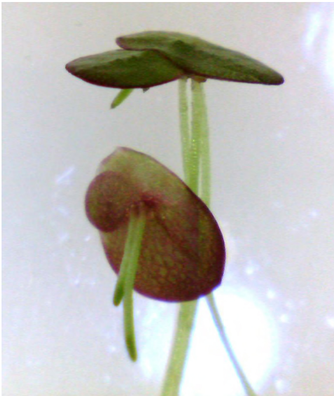
Figure 2. Detail of two specimens of Landoltia punctata showing roots: side view (upper plant) and bottom view (lower plant).

Landoltia punctata had hitherto its southernmost occurrence in the Americas recorded in Pontal do Paraná, Paraná state, southern Brazil (Pott 2002; Coelho et al. 2010). However, we collected this species in three different municipalities in eastern Santa Catarina state (Figure 3): in Ilhota in 1999, in Braço do Norte in 2009 and in Florianópolis in 2013. In all these three localities L. punctata was found growing spontaneously, i.e. without human interference. These are the first records of this species in Santa Catarina, and are also the southernmost records in the Americas, corresponding to a distribution expansion of ca. 300 km. In addition to these new collections, we revised the entire Lemnoideae collections at herbaria FLOR, MBM and UPCB.